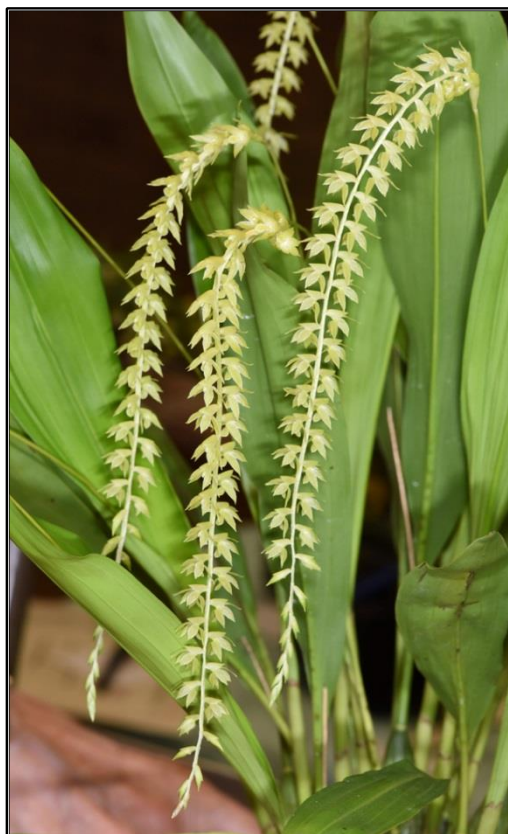
Dendrochilum longifolium