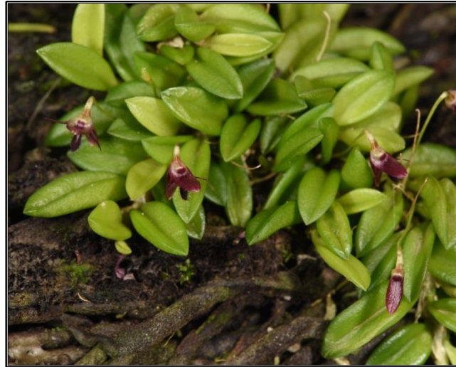
Bulbophyllum macphersonii