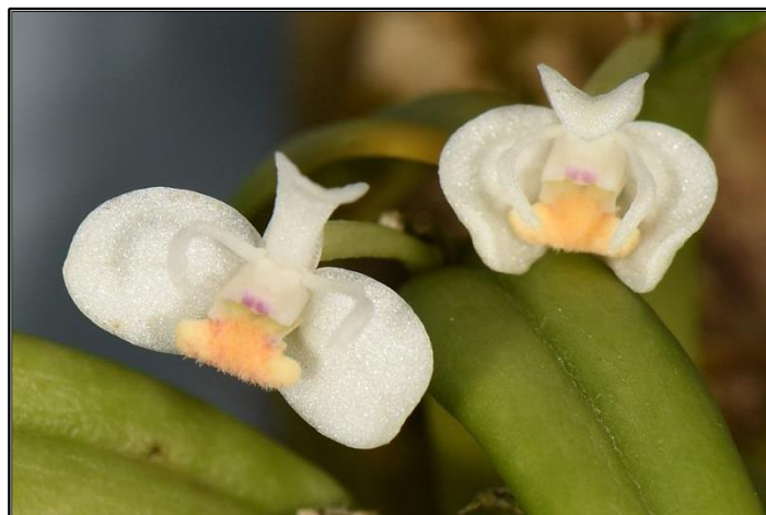
Cadetia taylorii