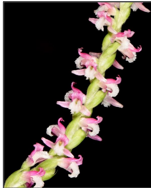
Spiranthes australis – Trish Peterson