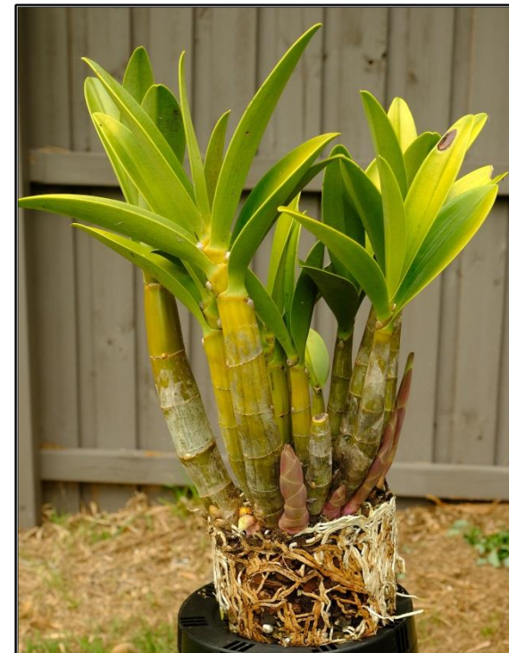
Dendrobium speciosum var. capricornicum 'Granite' – L & B Dobson