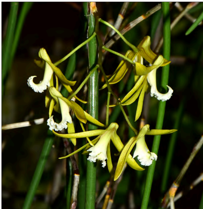
Dockrillia Amphion Helios David Hemmings