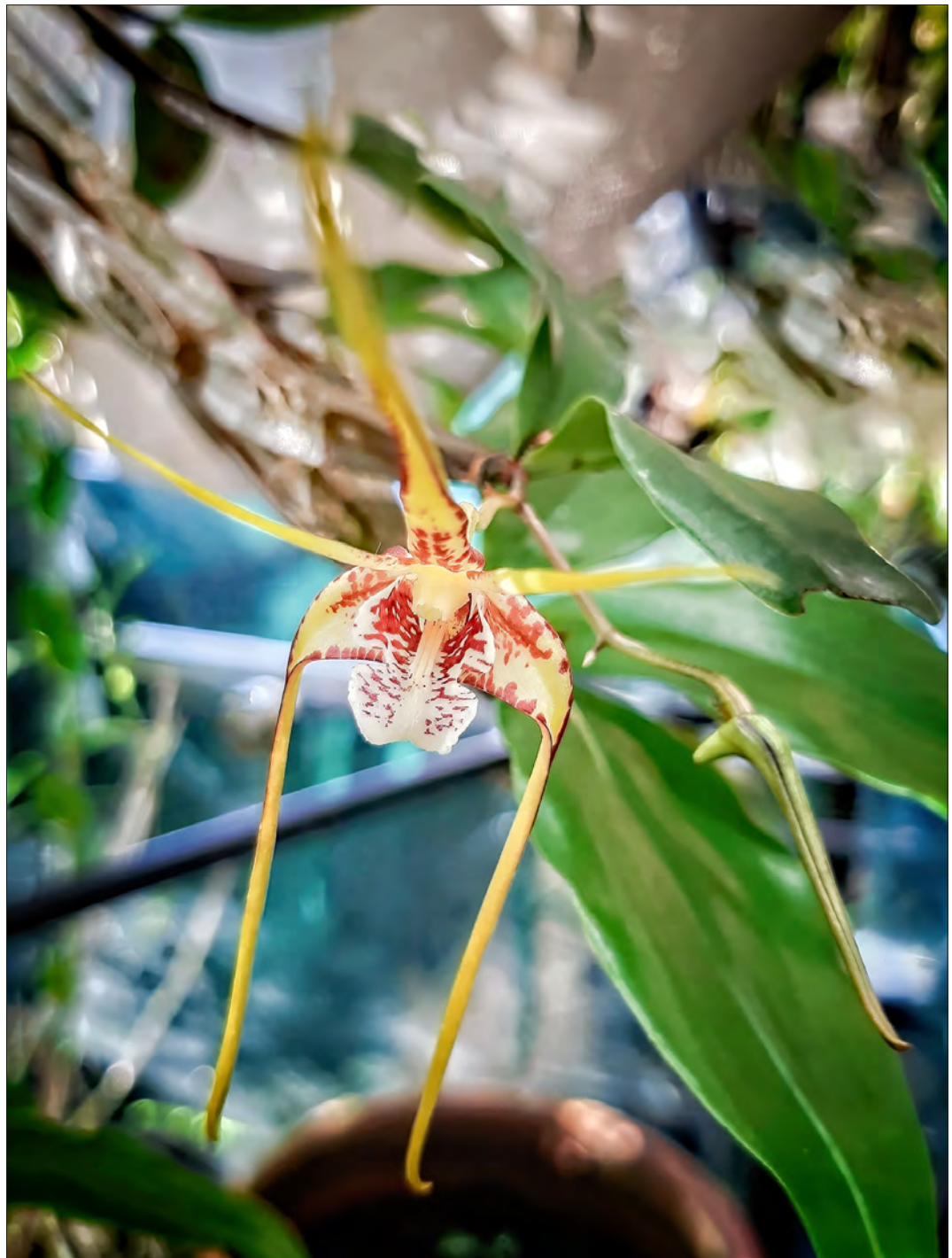
Dendrobium tetragonum - Conway Ranges form Trish Peterson