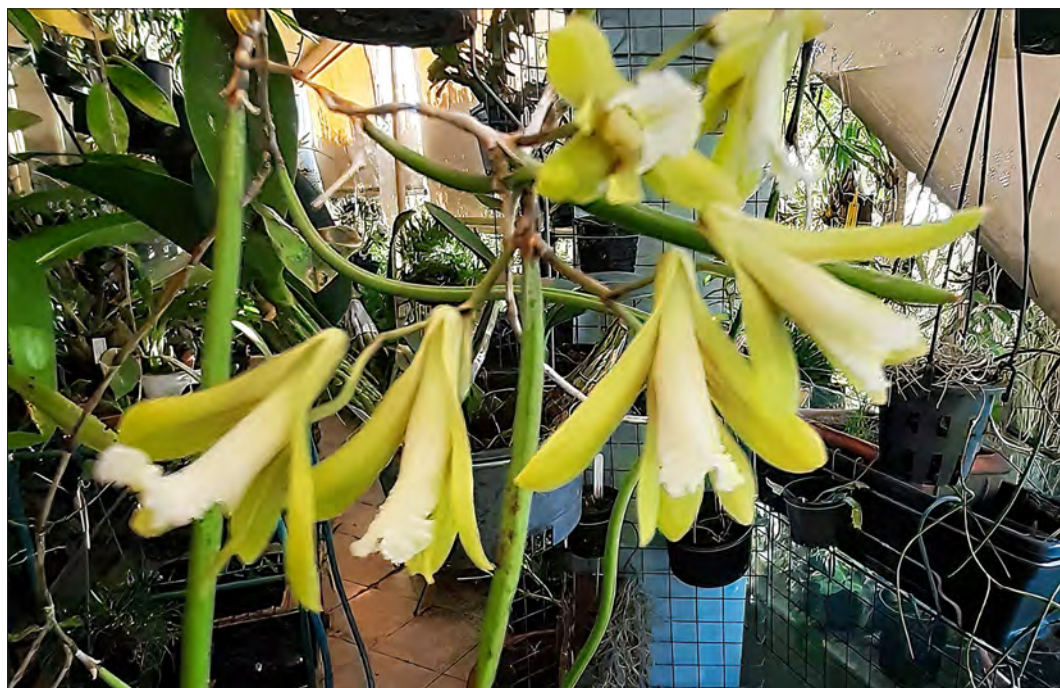
Dockrillia bowmanii