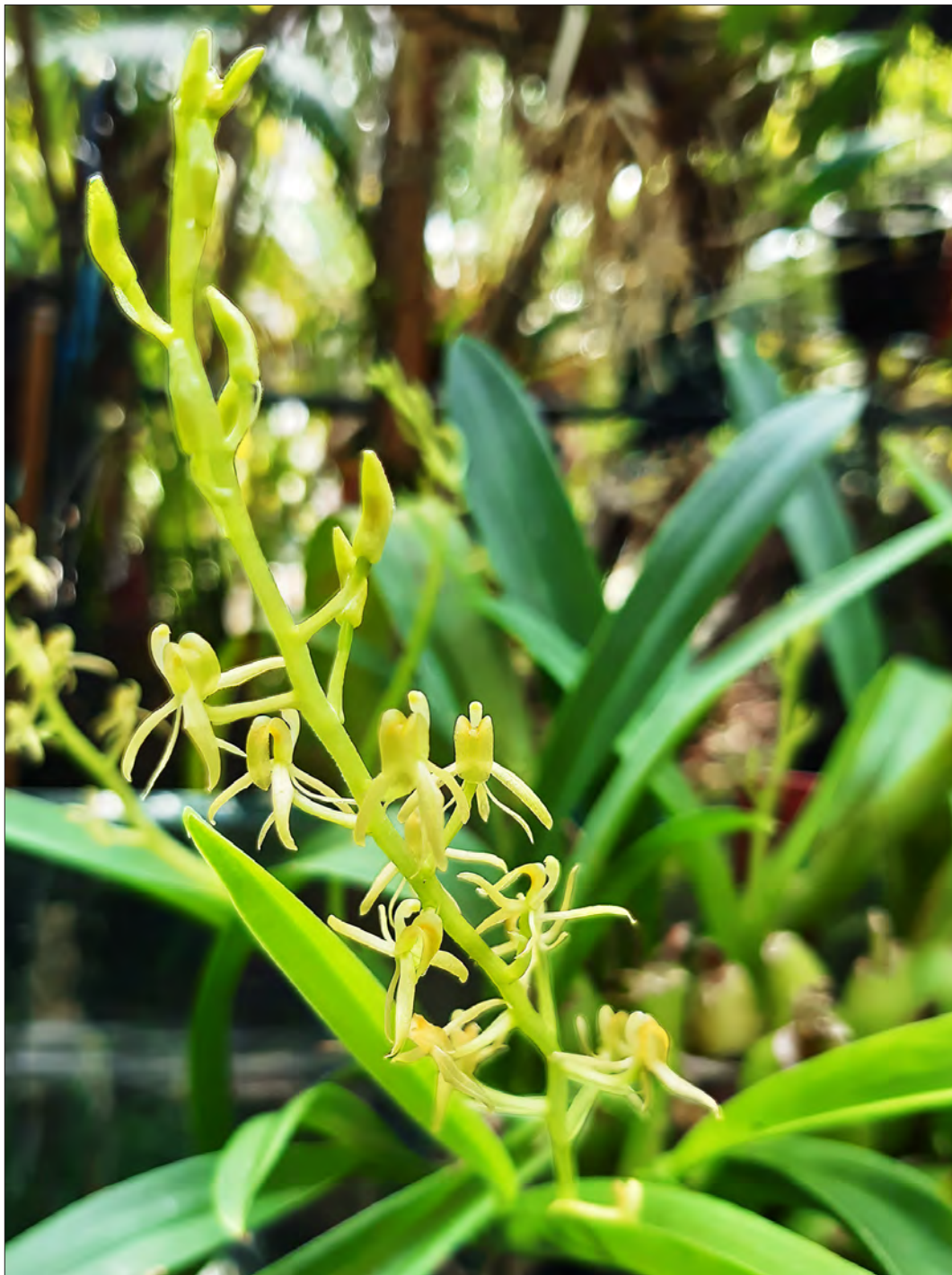
Liparis swenssonii