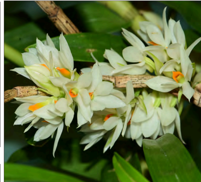
Dendrobium bracteosum Cary Polis