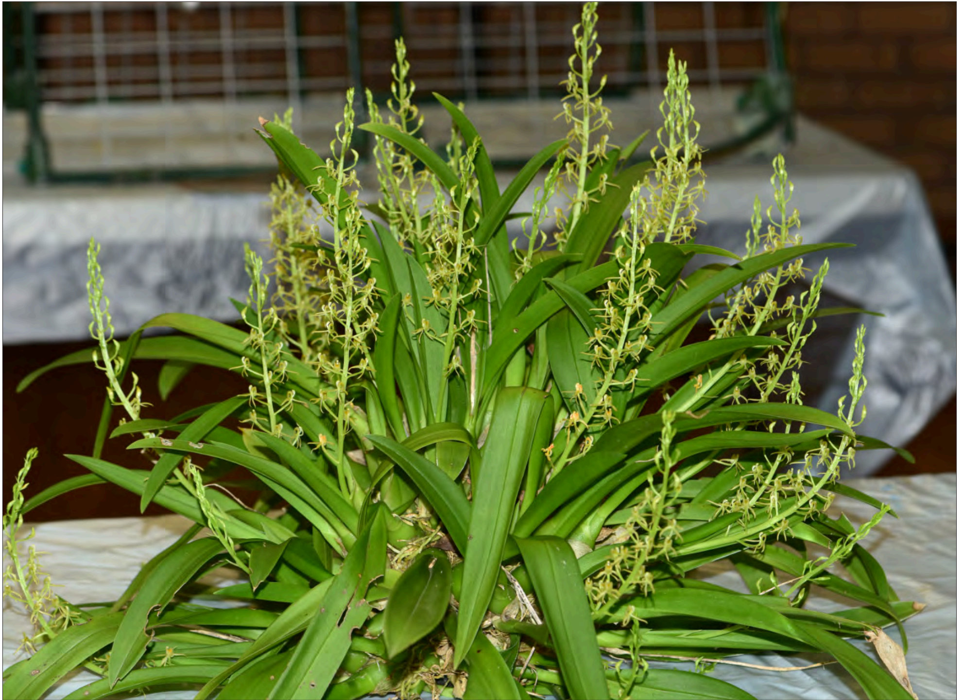
Liparis swenssonii