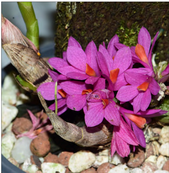
Dendrobium Hibiki