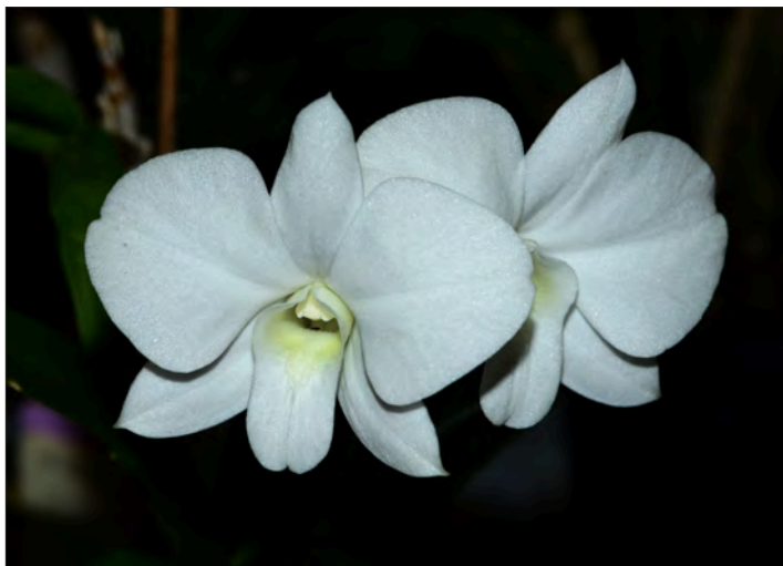
Dendrobium bigibbum Hybrid Ela Kielich