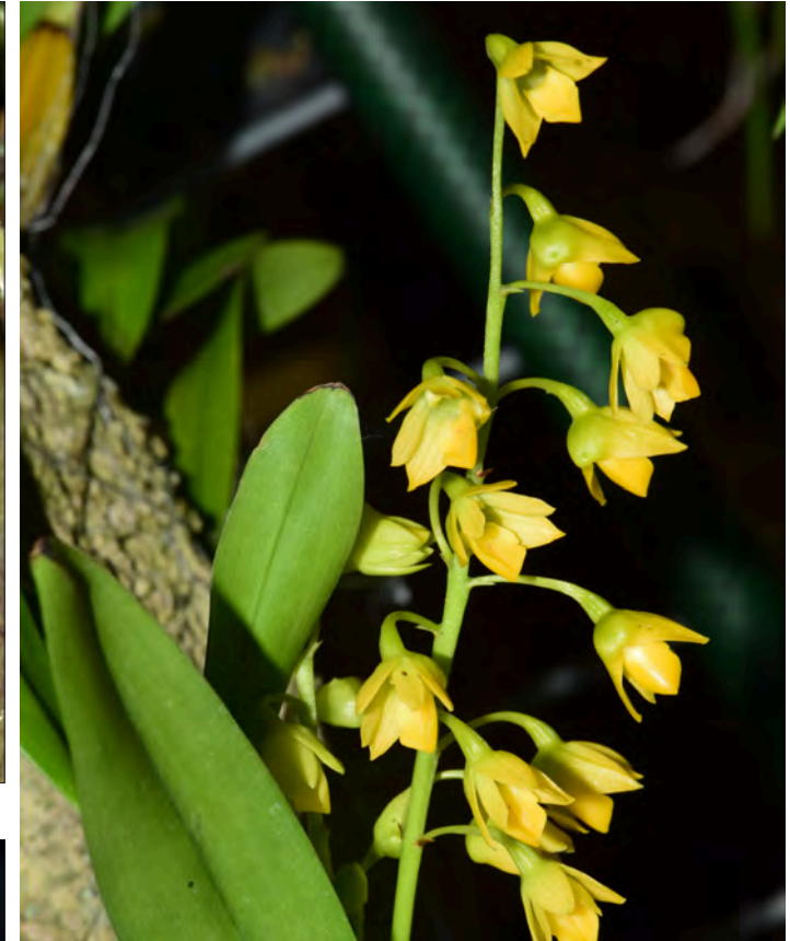
Dendrobium monophyllum