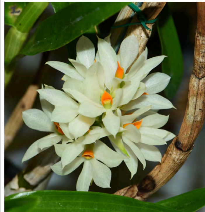
Dendrobium bracteosum Cary Polis