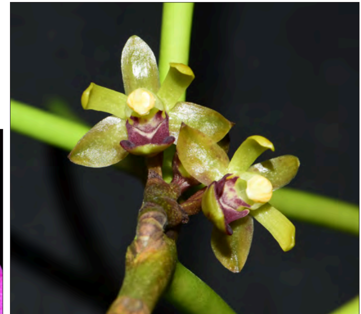
Luisia teretifolia