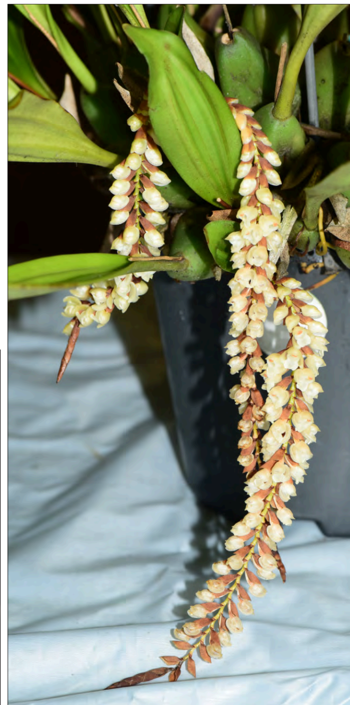
Pholidota imbricata Li Shan