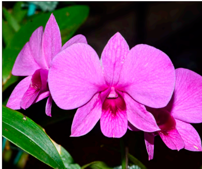
Dendrobium bigibbum hybrid Ela Kielich