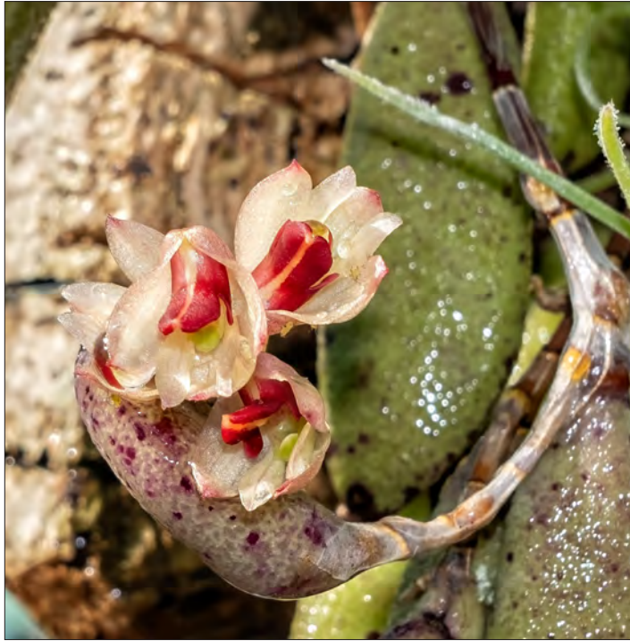
Dockrillia rigida

Committee meetings are easy and are held just prior to our monthly meeting, so you don't even have to go out any other time.