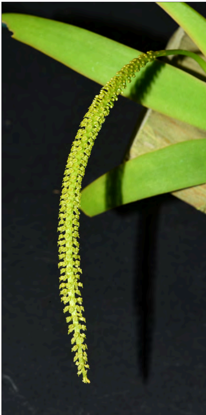
Oberonia complanata

This orchid usually grows on rocks and trees in humid, well-lit situations. It is found in Queensland it occurs between the Iron Range and Mcllwraith Range.