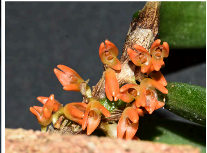
Bulbophyllum schillerianum Cary Polis