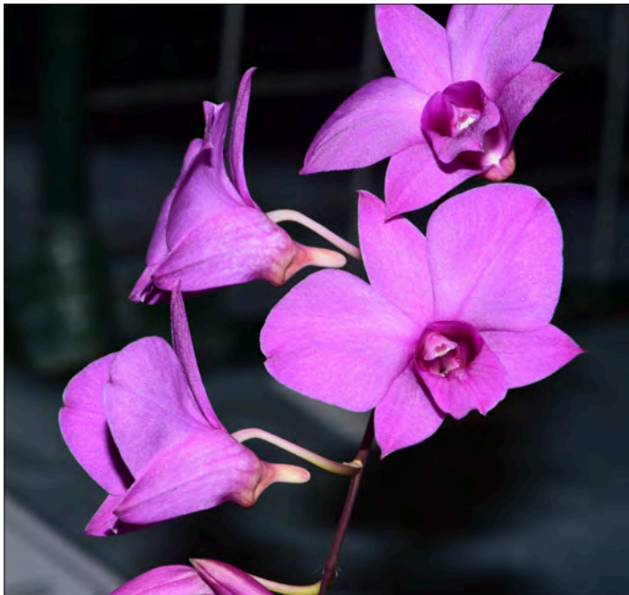
Dendrobium bigibbum 'Lesley' Cary Polis