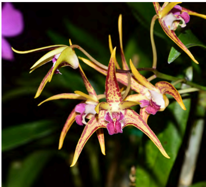
Dendrobium Rutherford Starburst 'Tinonee' Ela Kielich