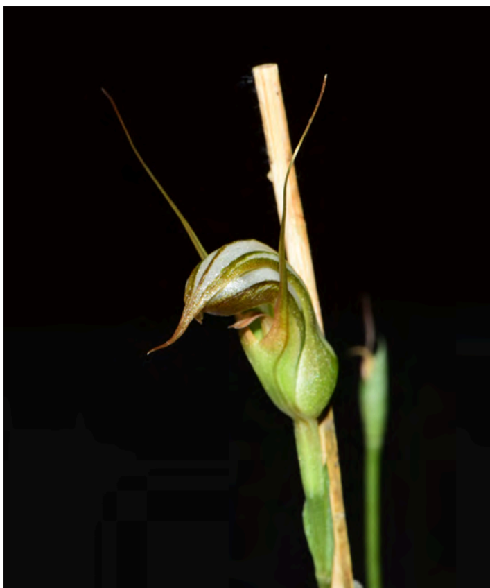
Pterostylis sp.