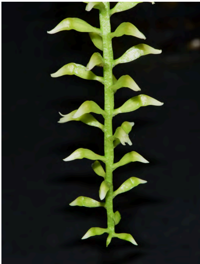
Thelasis carinata Erik Lielkajis

Thelasis carinata , commonly known as the triangular fly orchid, is a clump-forming epiphyte or lithophyte that lacks pseudobulbs. There are groups of between two and six erect, flattened stems each with up to six leaves that have a ridged lower surface. Up to fifteen green and white flowers are arranged on a thin but stiff flowering stem. Each stem has between three and six dark green leaves. Flowering is between April and June.