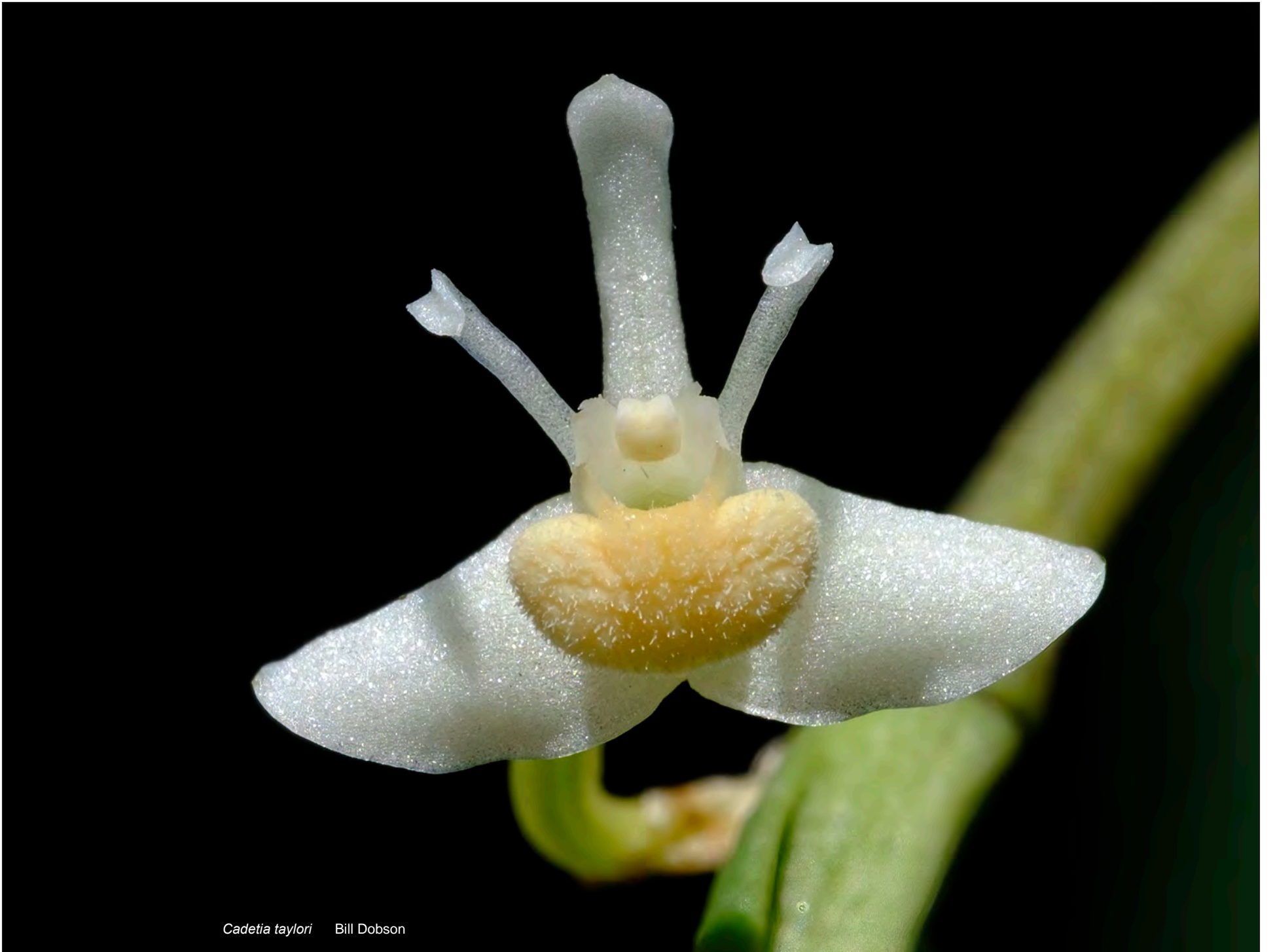
Cadetia taylori