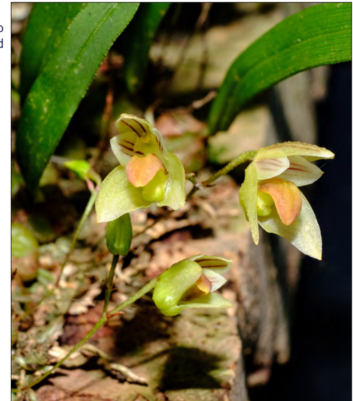
Bulbophyllum lageniforme Bill Dobson