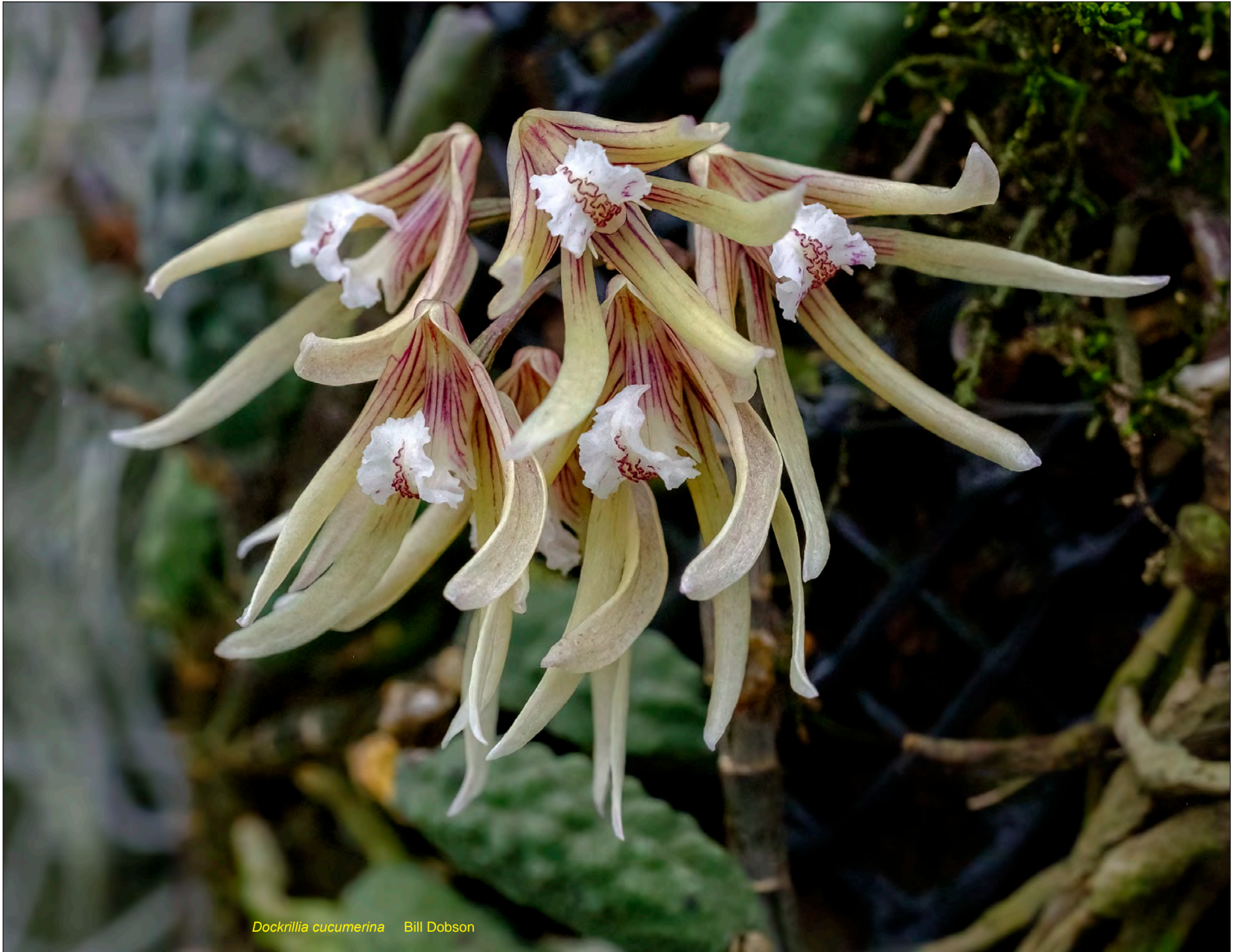
Dockrillia cucumerina