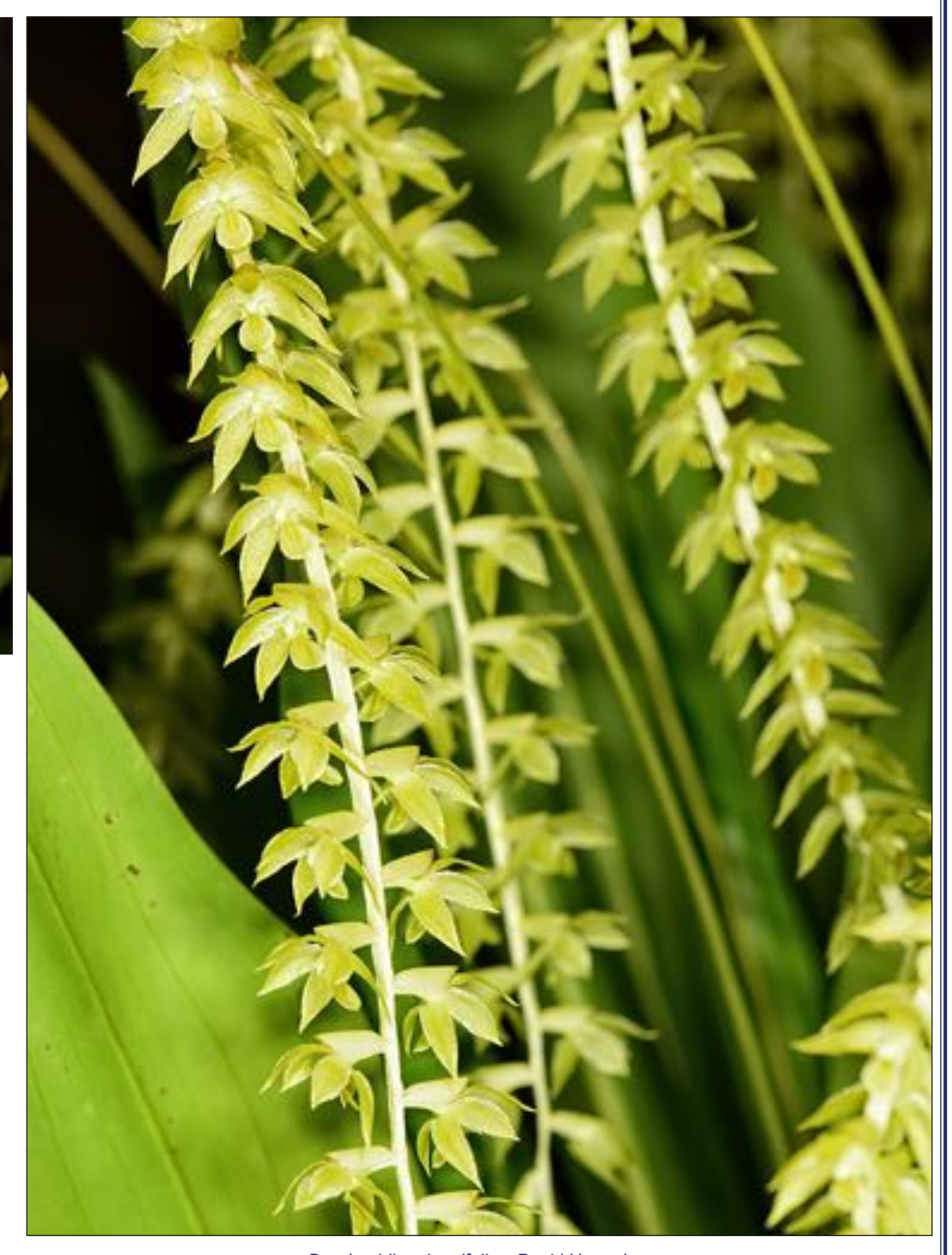
Dendrochilum longifolia