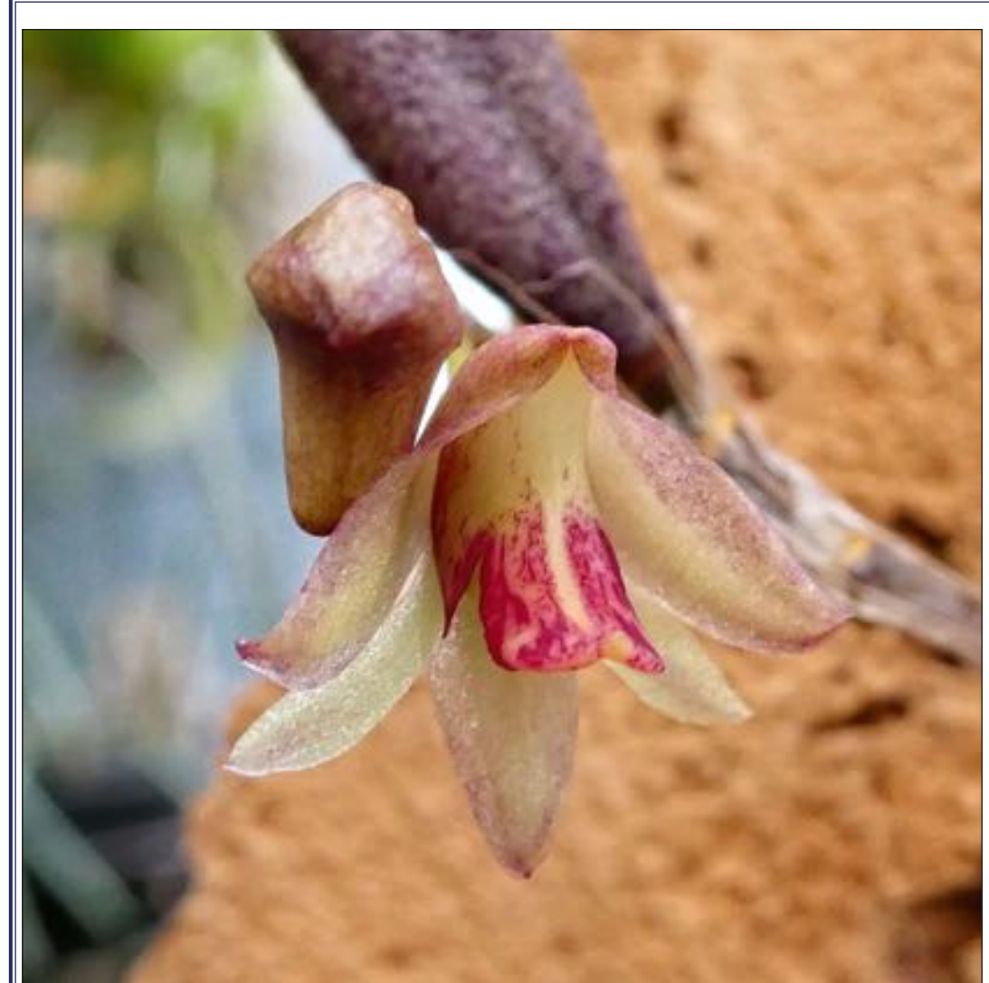
Dockrillia rigida