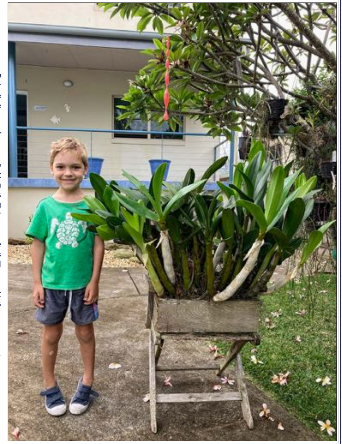
Den. speciosum var. grandiflorum 'Kroombit Gold'