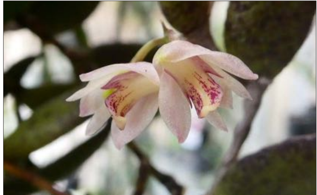
Dockrillia rigida