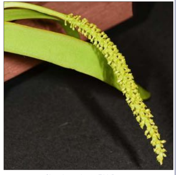
Oberonia complanata