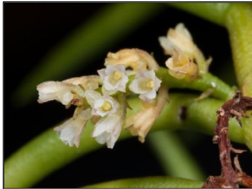
Schoenorchis micrantha