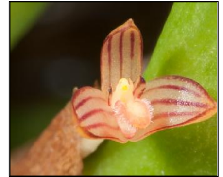
Bulbophyllum radicans