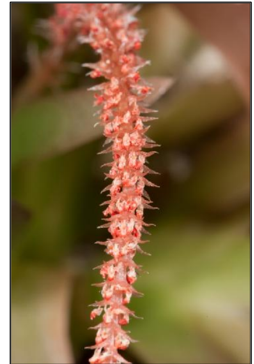
Oberonia titania