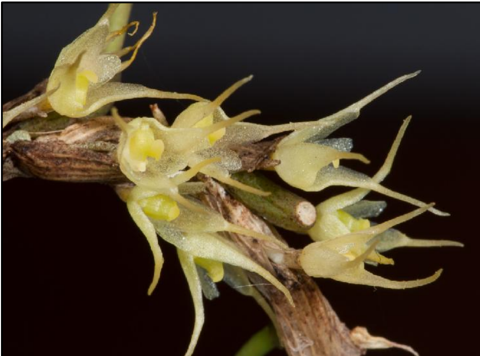
Bulbophyllum grandimesense