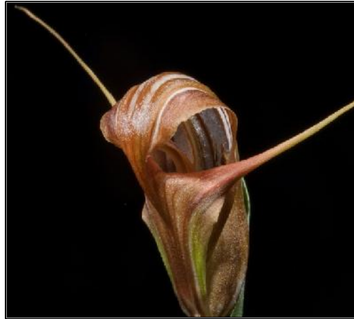
Taurantha (Pterostylis) tenuicauda [Terrestrial from New Caledonia]