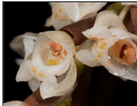
Pholidota imbricata