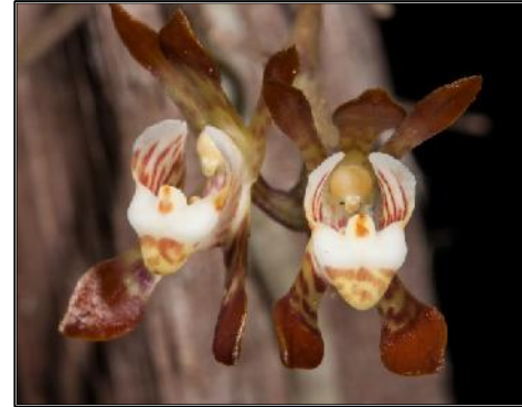
Sarcochilus dilatatus