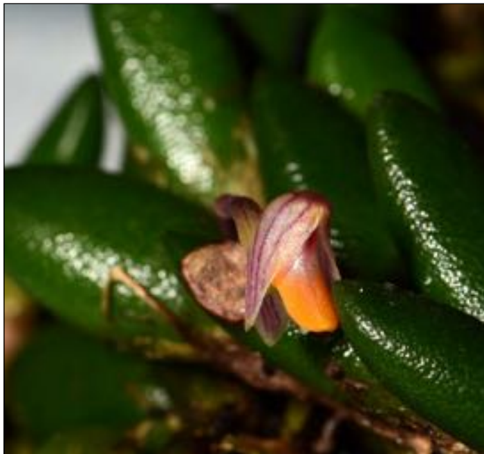
Dendrobium lichenastrum