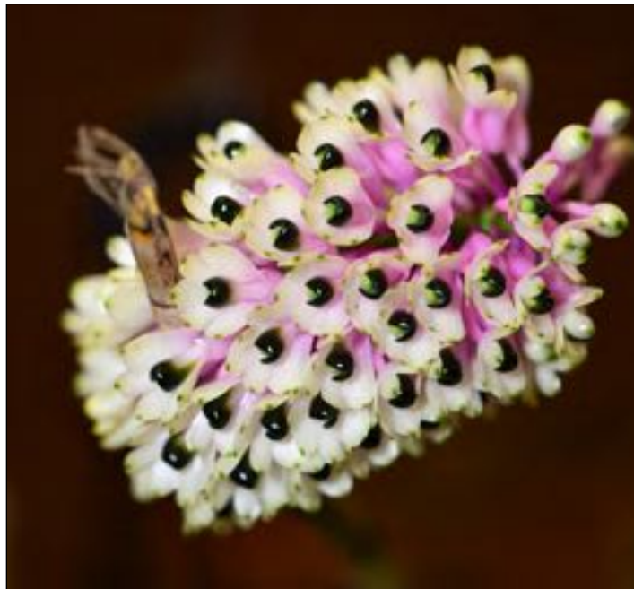
Dendrobium smilliae Cary Polis