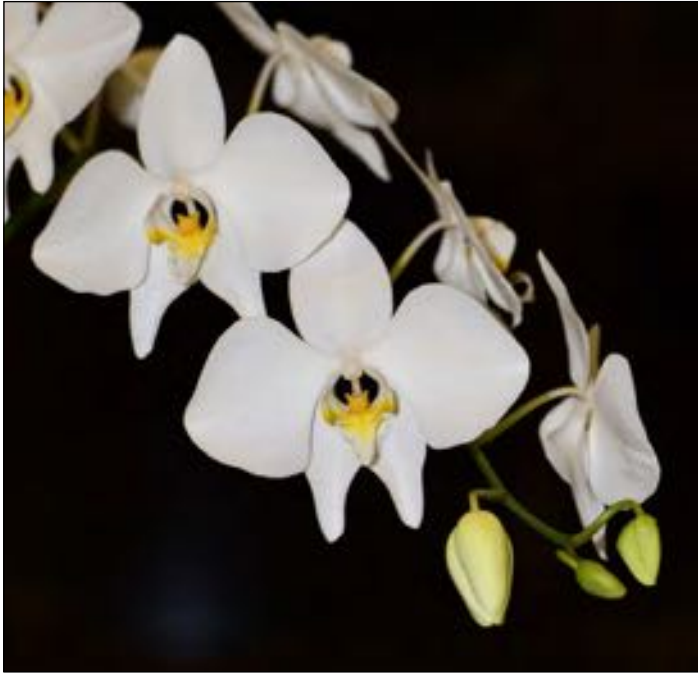
Phalaaenopsis rosenstromii Cary Polis