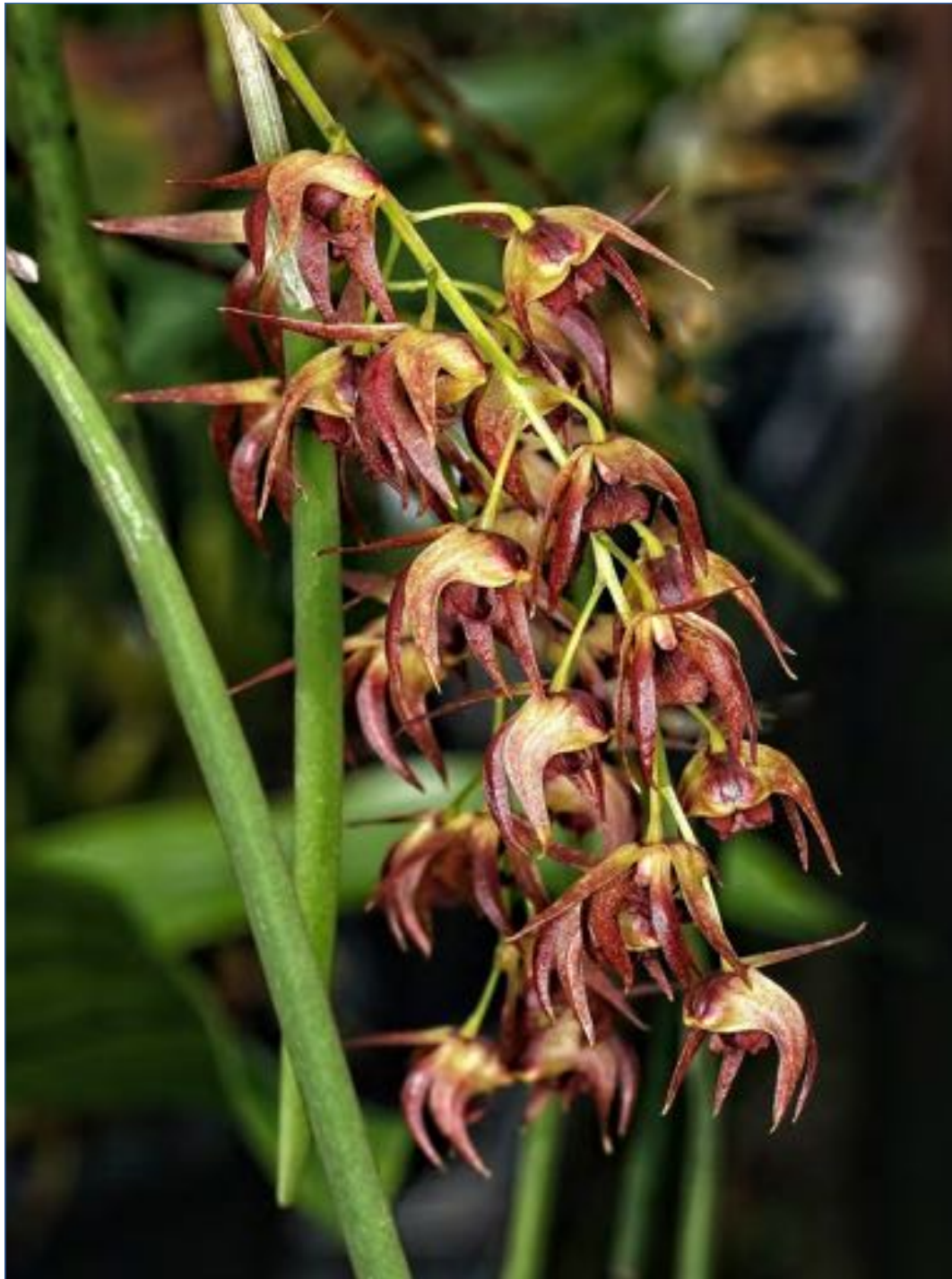
Dockrillia hepatica