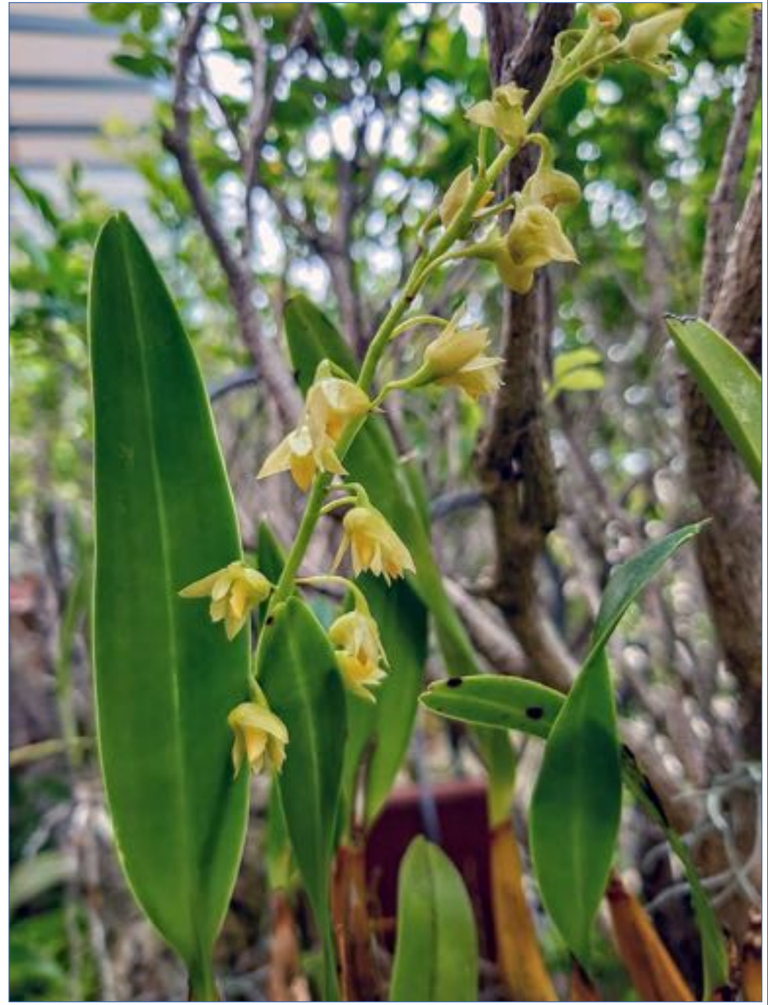
Dendrobium monophyllum Trish Peterson