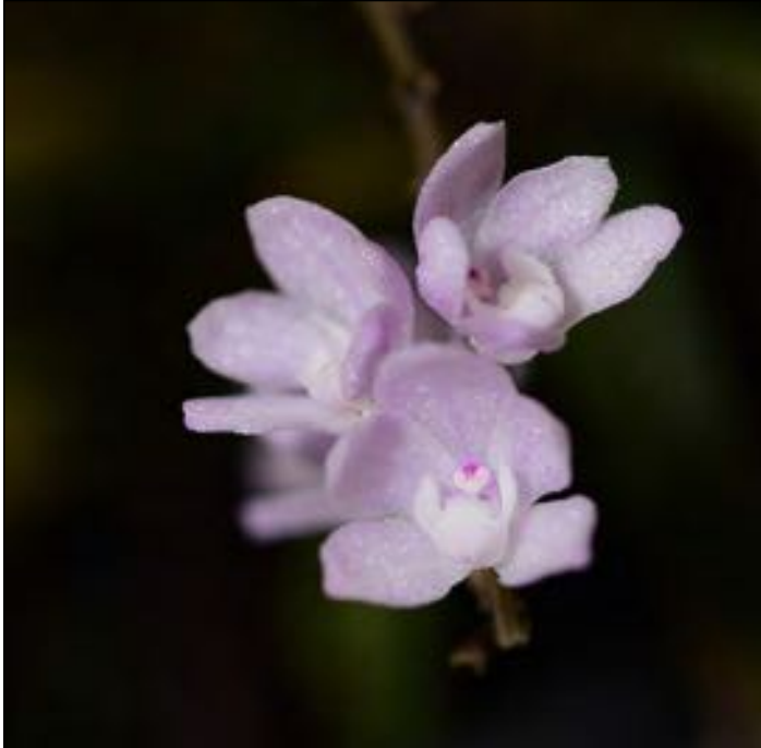
Sarcochilus eriochilus