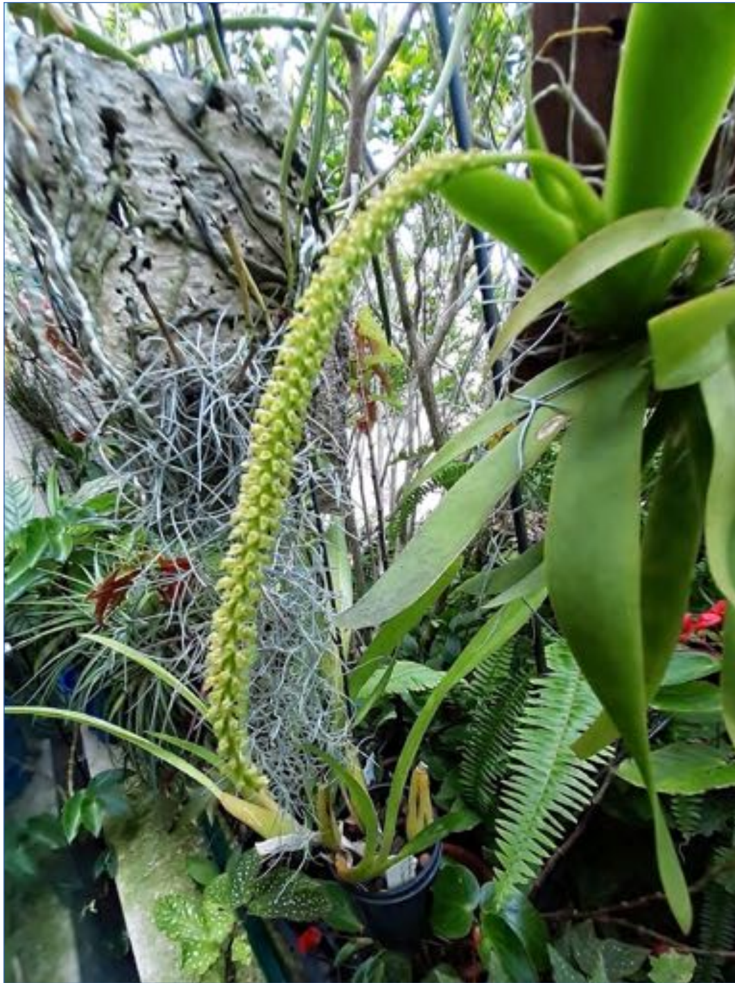
Oberonia complanata