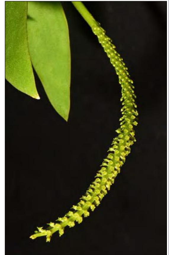
Oberonia complanata