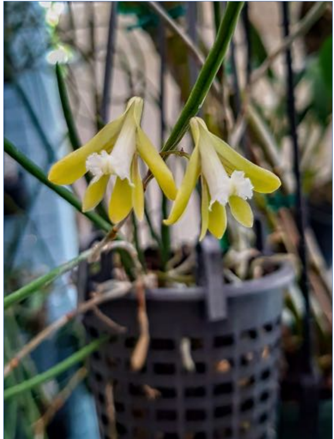
Dockrillia bowmannii