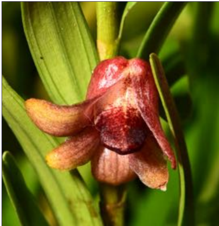
Dendrobium erectifolium Cary Polis