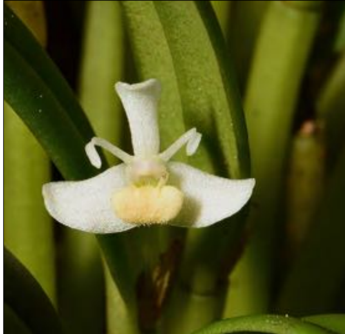
Cadetia taylori