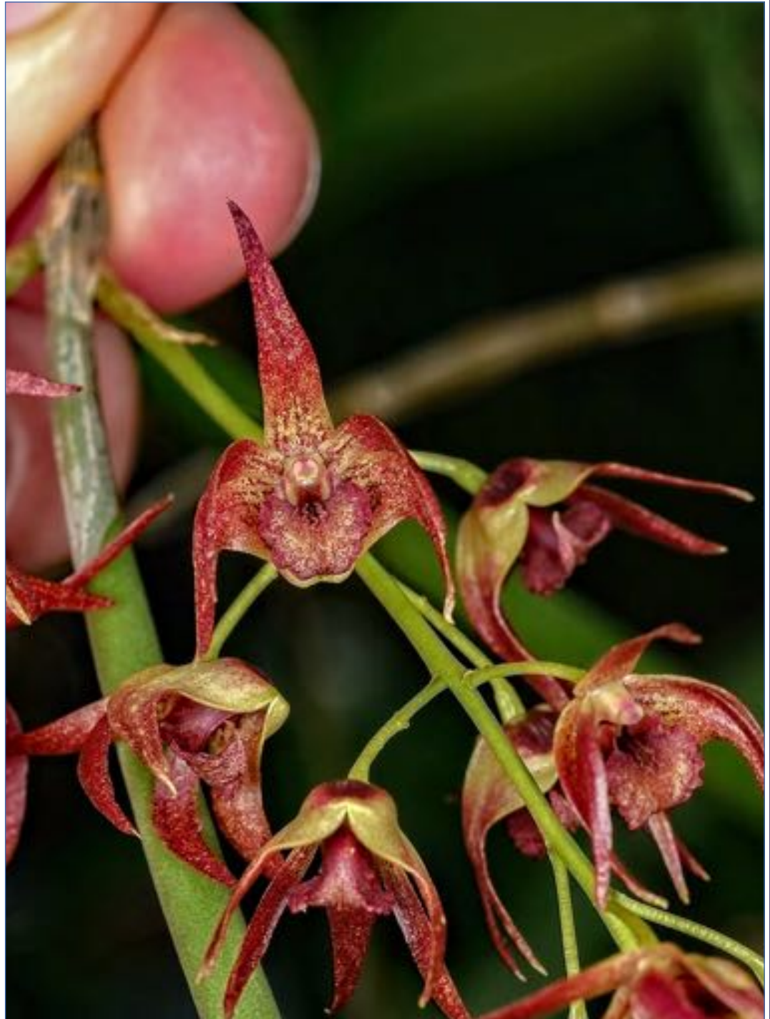
Dockrillia hepatica