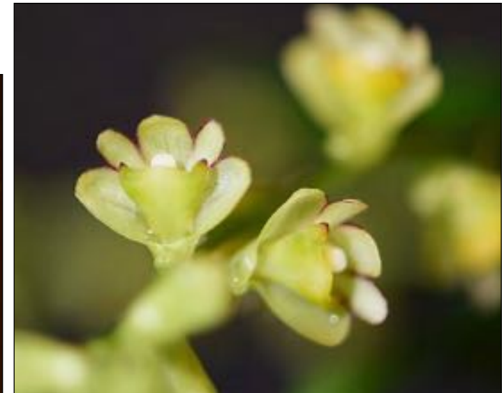
Dendrobium schneiderae