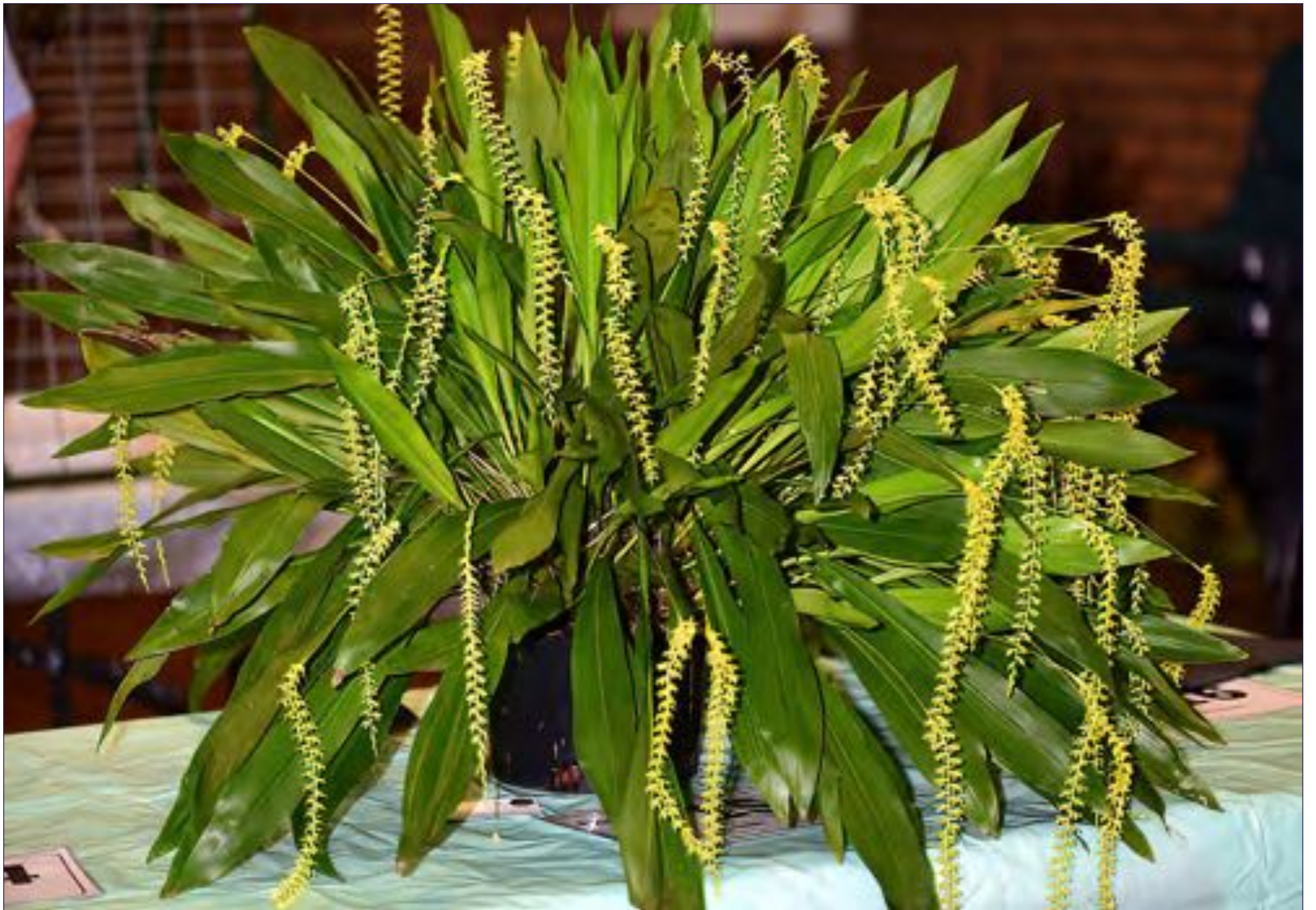
Dendrochilum longifolium