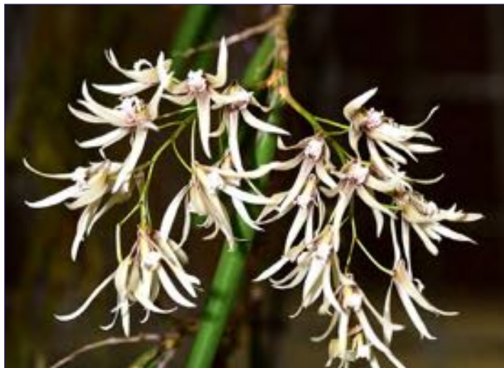
Dendrobium Goose Bumps David Hemmings