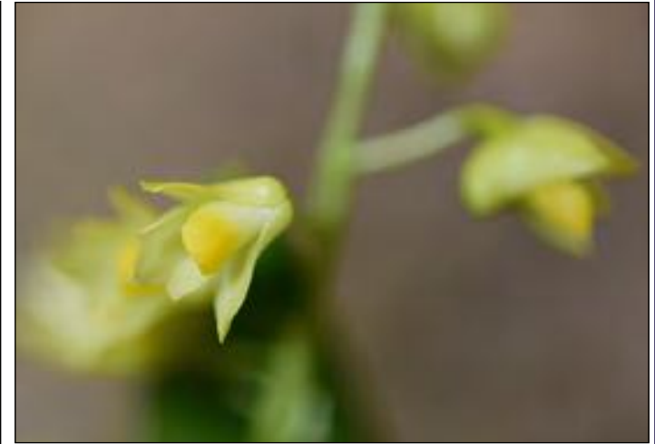
Dendrobium monophyllum Trish Peterson