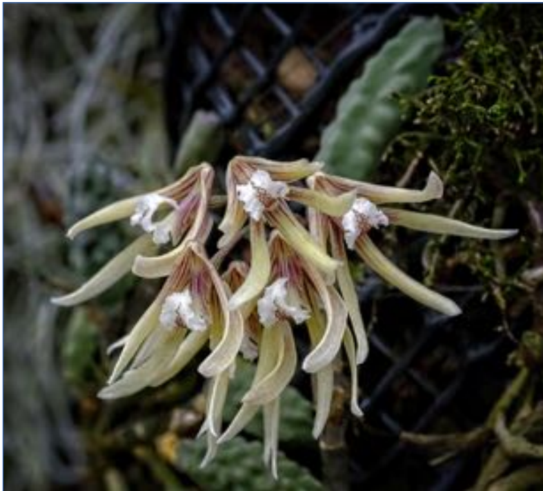
Dockrillia cucumerina