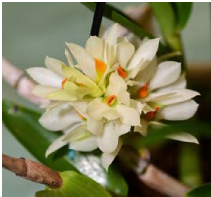
Dendrobium bractescens Cary Polis