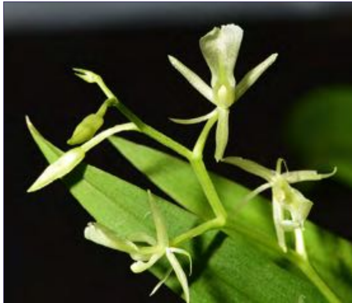
Liparis coelogenoides