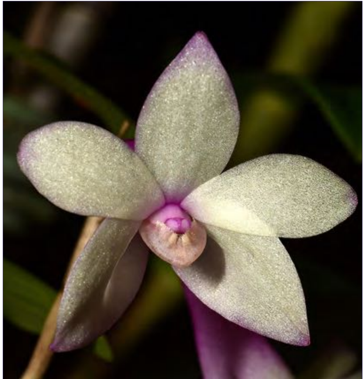
Dendrobium Pink Glow Li Shan

Dendrobium Pink Glow is a primary Hybrid between Dendrobium glomeratum × Dendrobium lawesii