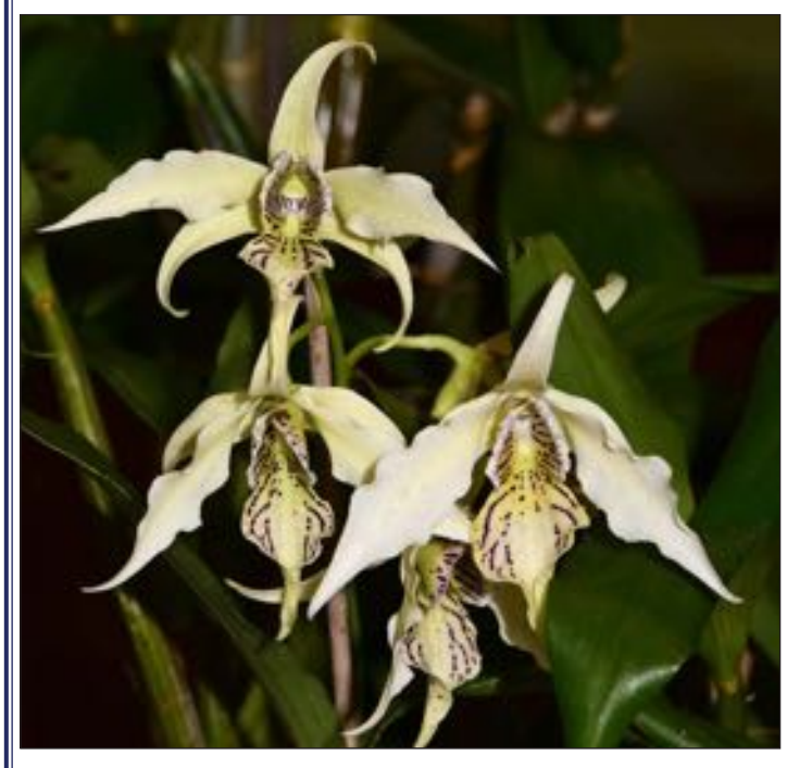
Dendrobium Stephen Batchelor