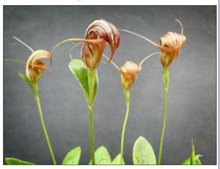
Pterostylis brevicauda Trish Peterson