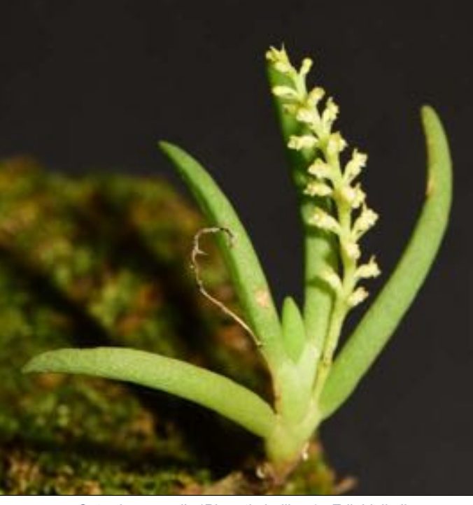
Octarrhena pusila (Phreatia bailiana)