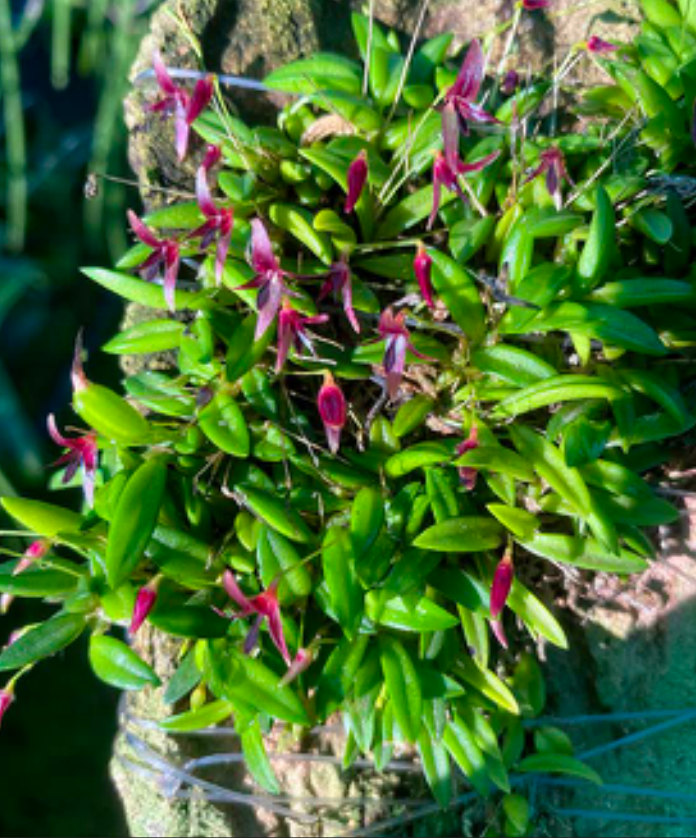
Bulbophyllum macphersonii L & B Dobson

well in these along with some other plants such as Den. While your plants are growing feed them. I noticed recently aemulum which, for me took to them like a duck to water.