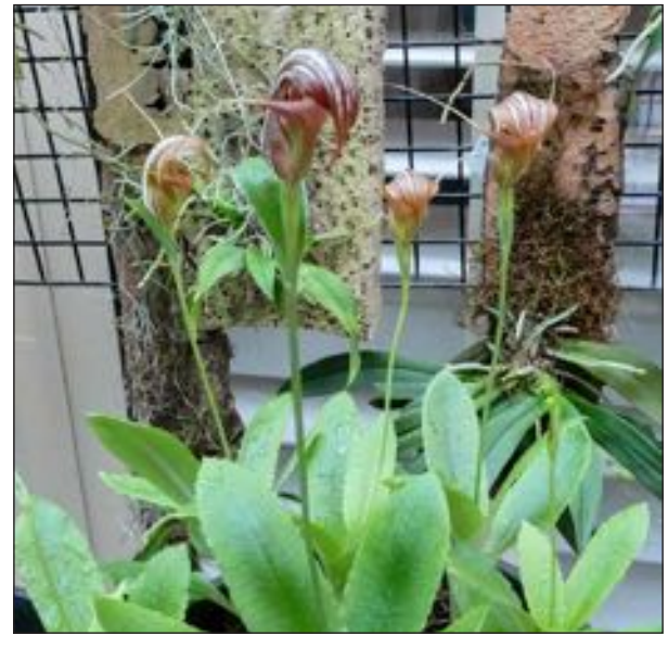
Pterostylis brevicauda Trish Peterson