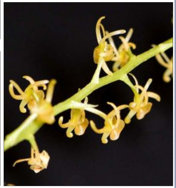
Liparis angustilabris