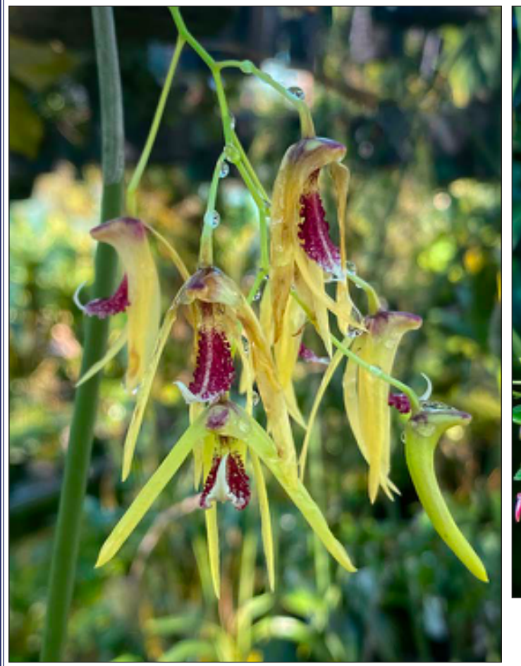
Dockrillia Granma 'Pure'