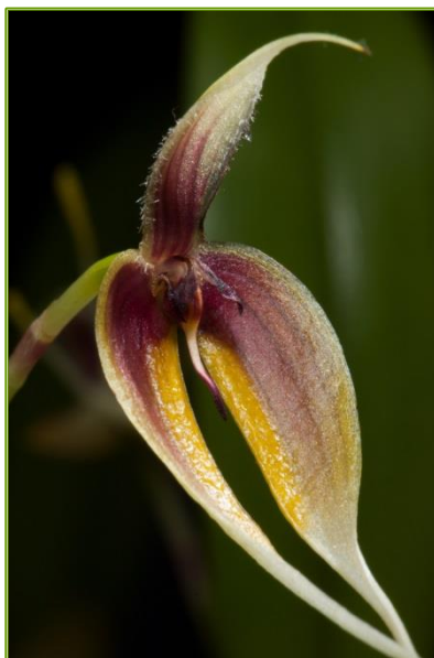
Bulbophyllum blumei