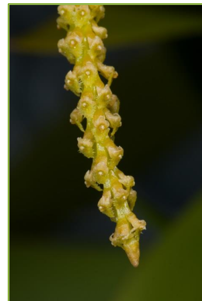
Oberonia flavescens