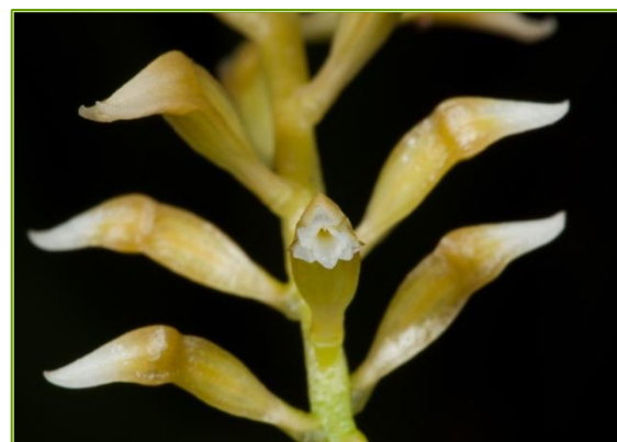
Thelasis carinata