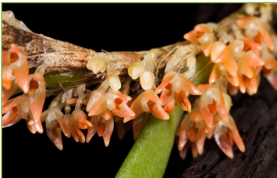
Bulbophyllum schillerianum ssp. maritima