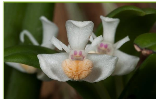
Cadetia taylorii