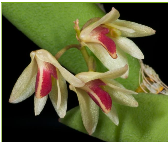
Dockrillia rigida