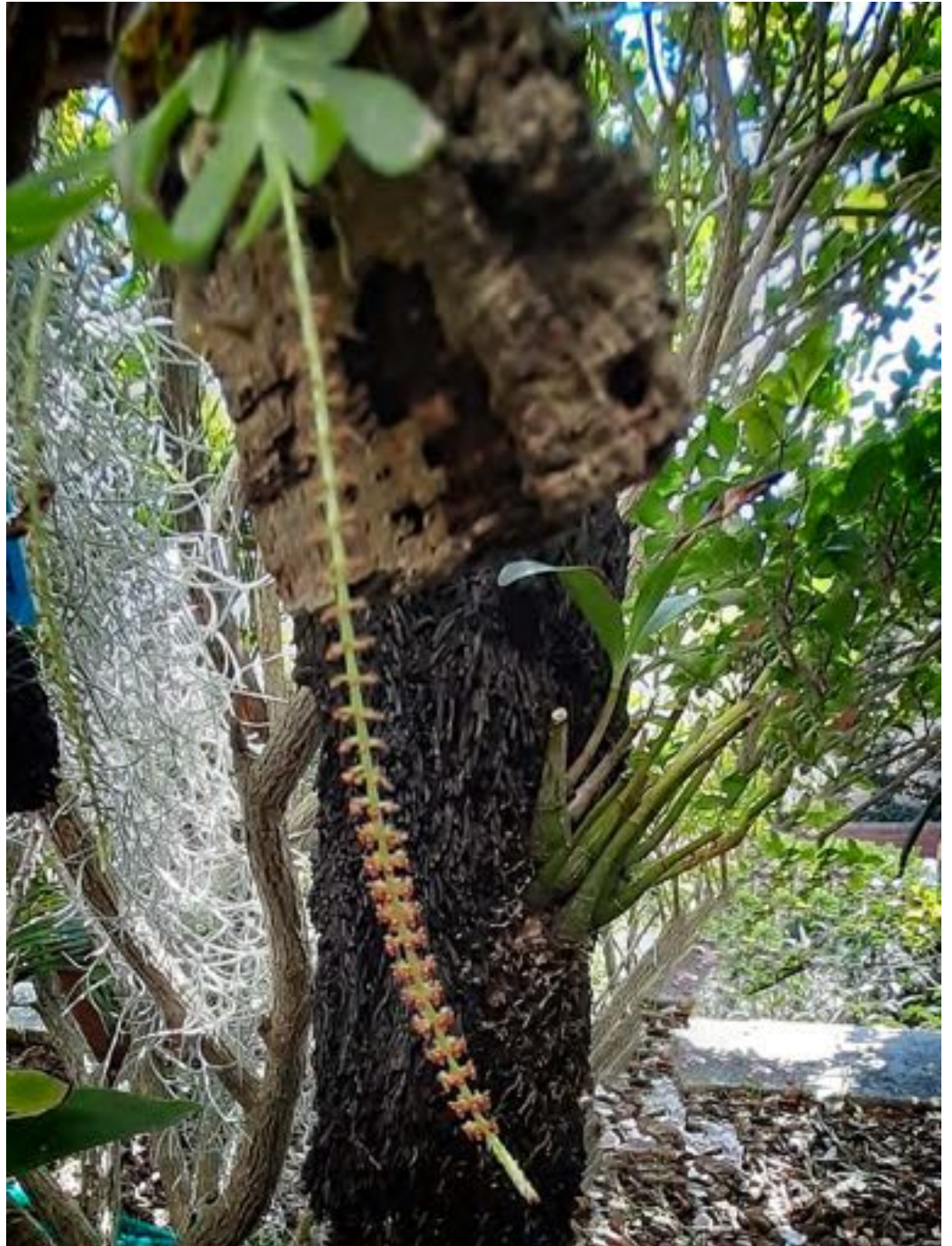
Oberonia crateriformis Trish Peterson