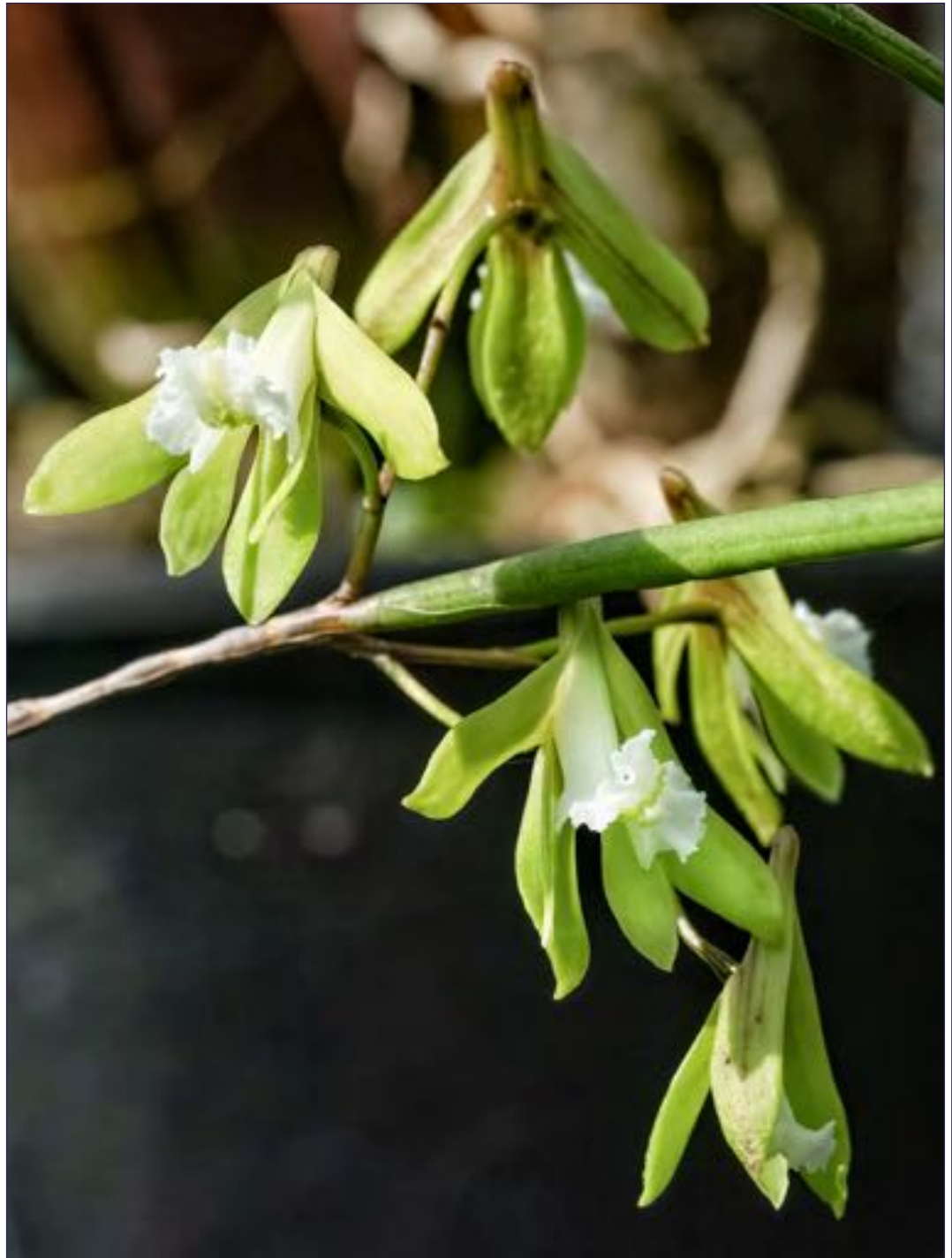
Dockrillia bowmanni