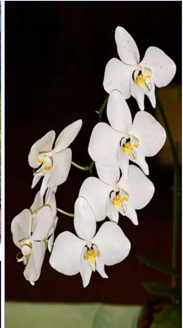
Phalaenopsis rosenstromii Cary Polis