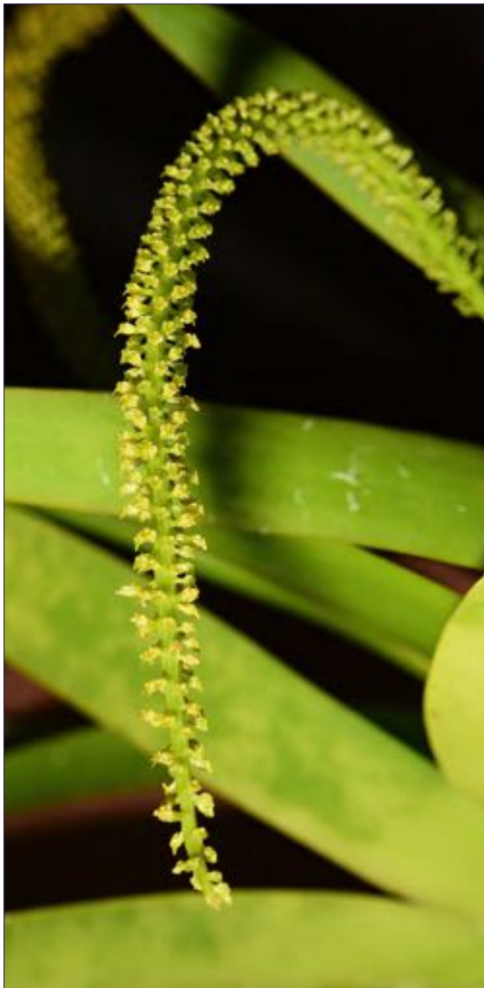
Oberonia complanata