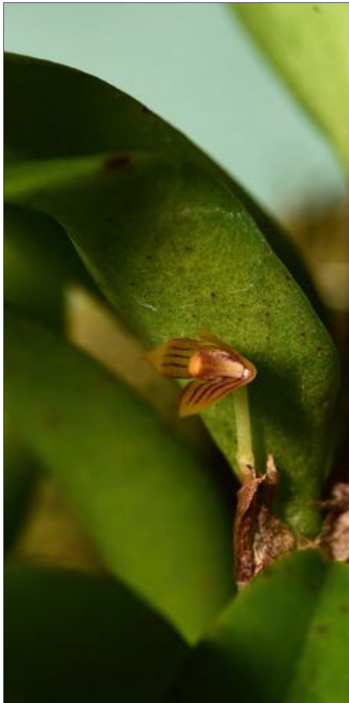
Bulbophyllum radicans