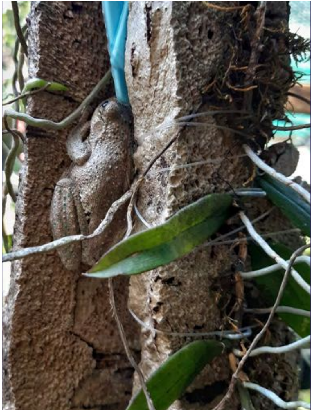
Peron's Tree Frog Trish Peterson