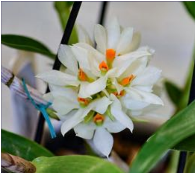
Left Dendrobium bracteosum Cary Polis