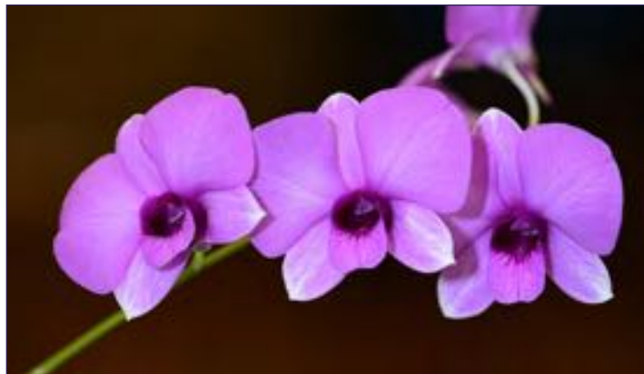
Dendrobium bigibbum 'Lesley' Cary Polis