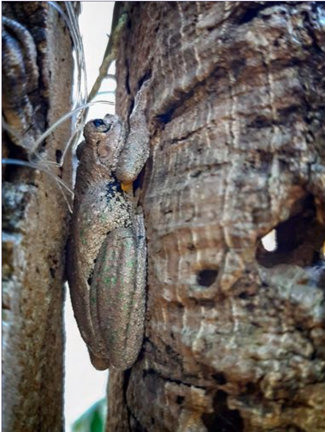
Peron's Tree Frog Trish Peterson