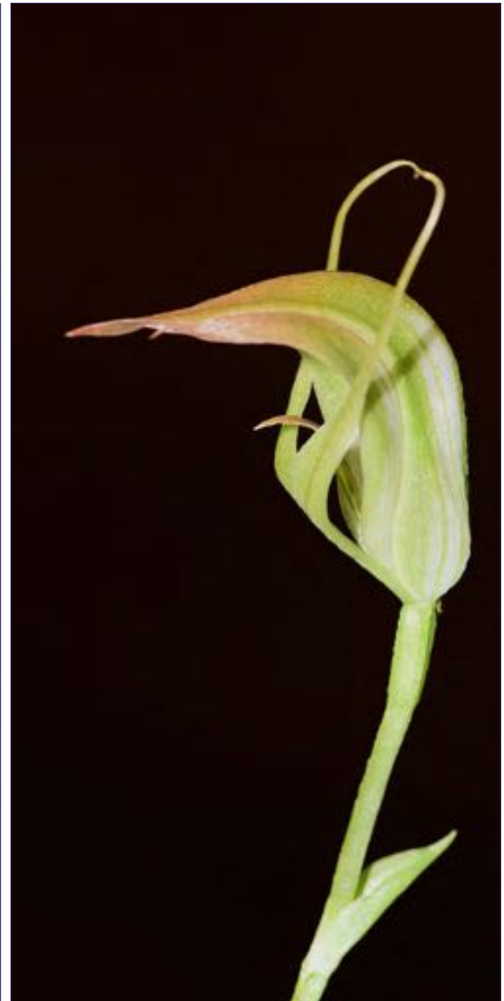
Pterostylis accuminata