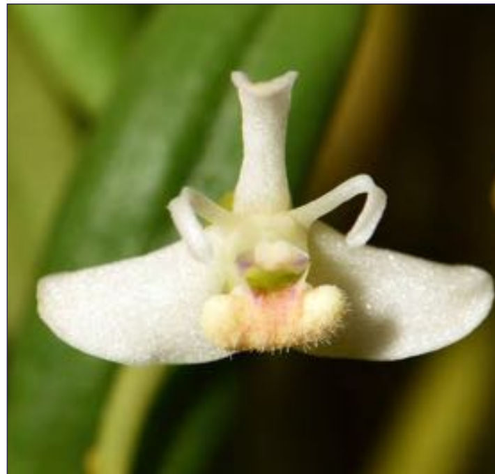
Cadetia taylori