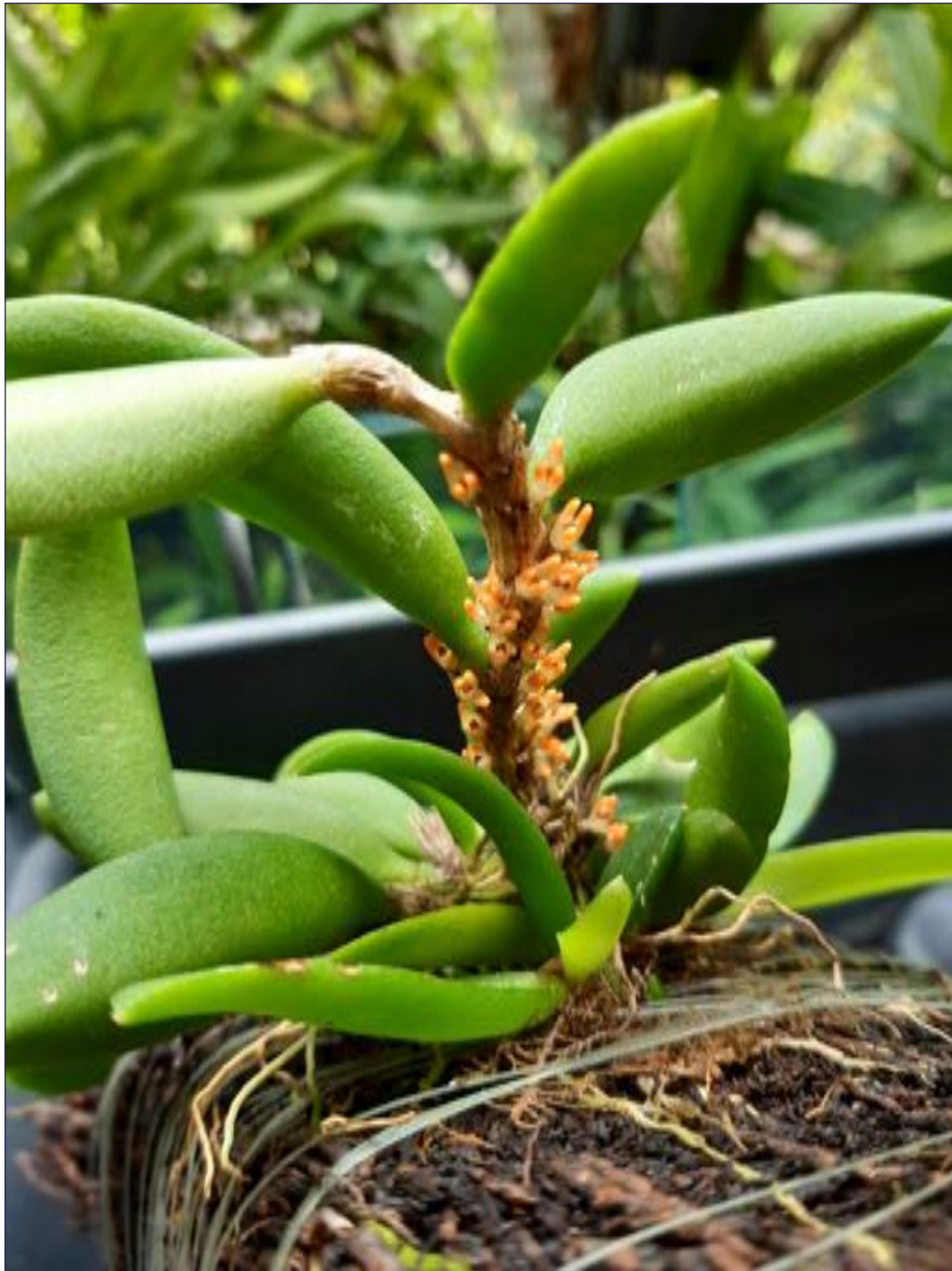
Bulbophyllum schillerianum Trish Peterson