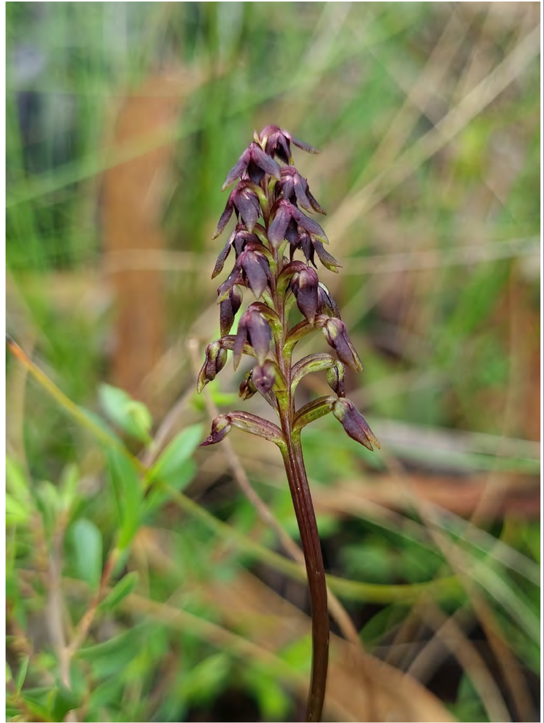
Corunastylis ruppii (Ku-ring-gai NP)