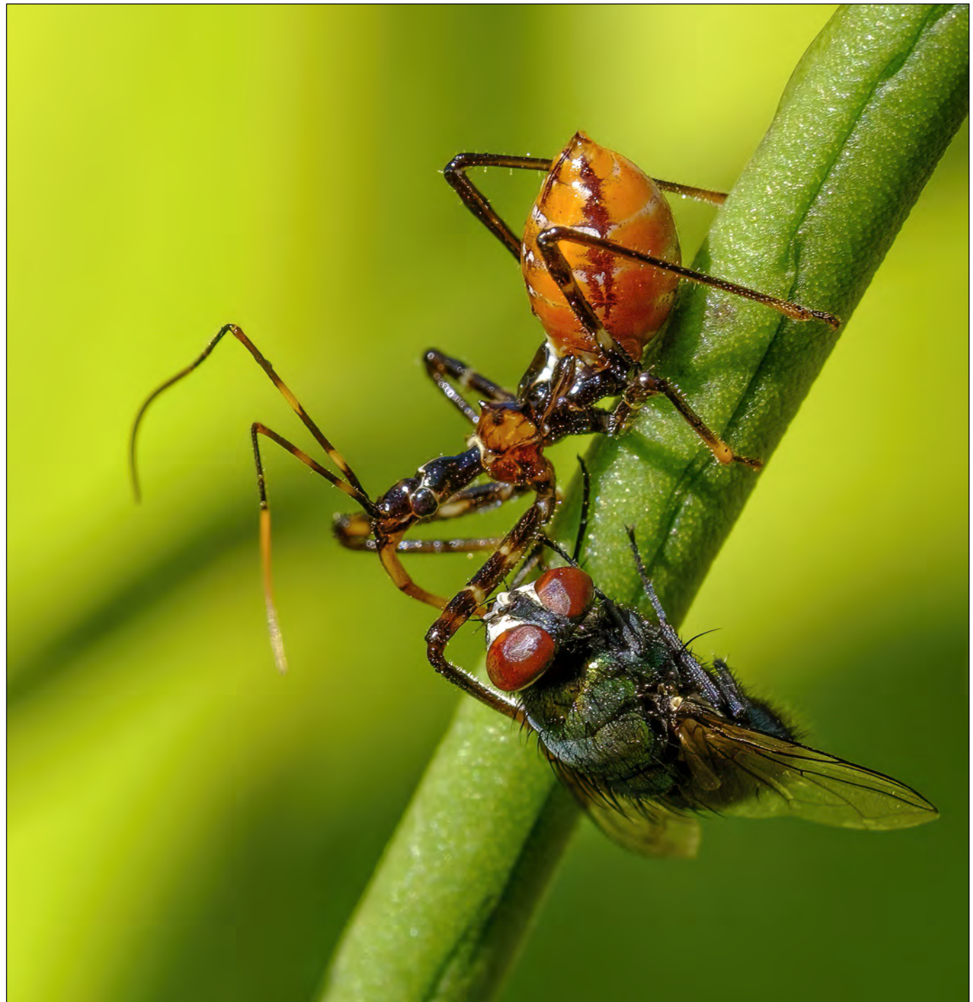
Golden-Brown Assassin Bug - Pristhecanthus plagipennis and prey