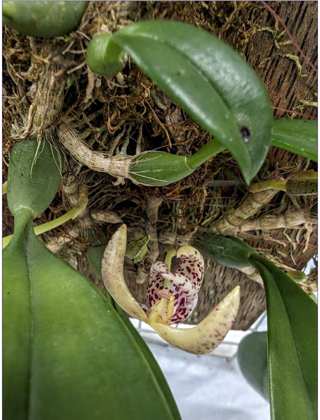
Bulbophyllum baileyi Jim Hemmings