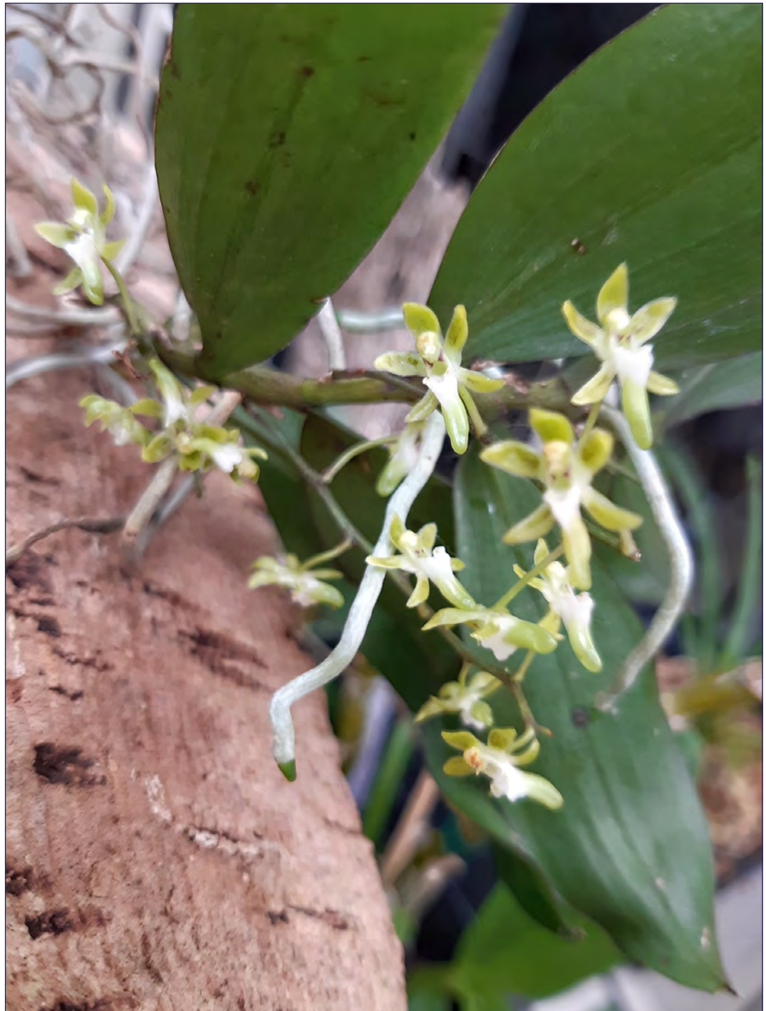
Plectorrhiza brevilabris