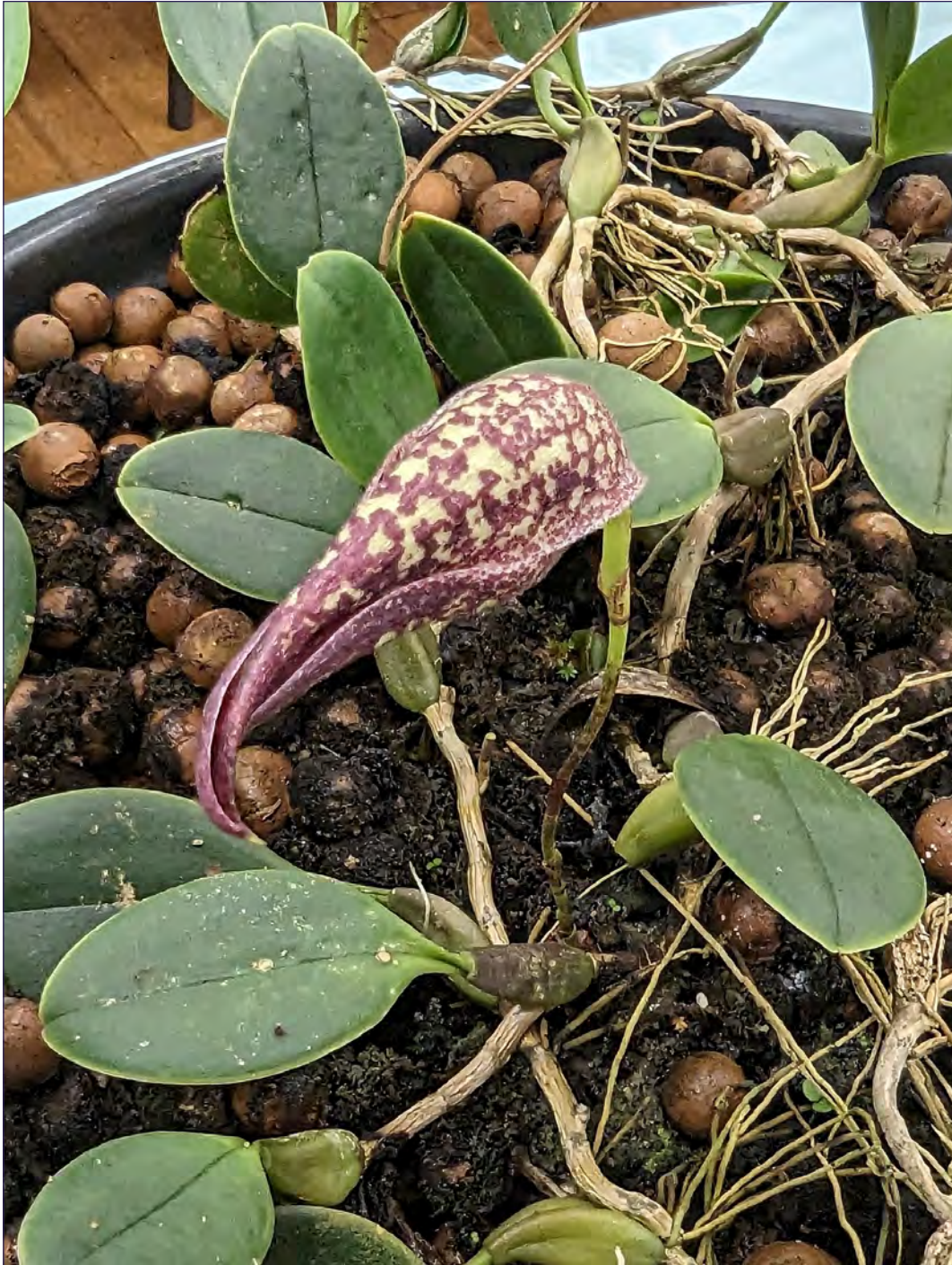
Bulbophyllum africans I & I Chalmers