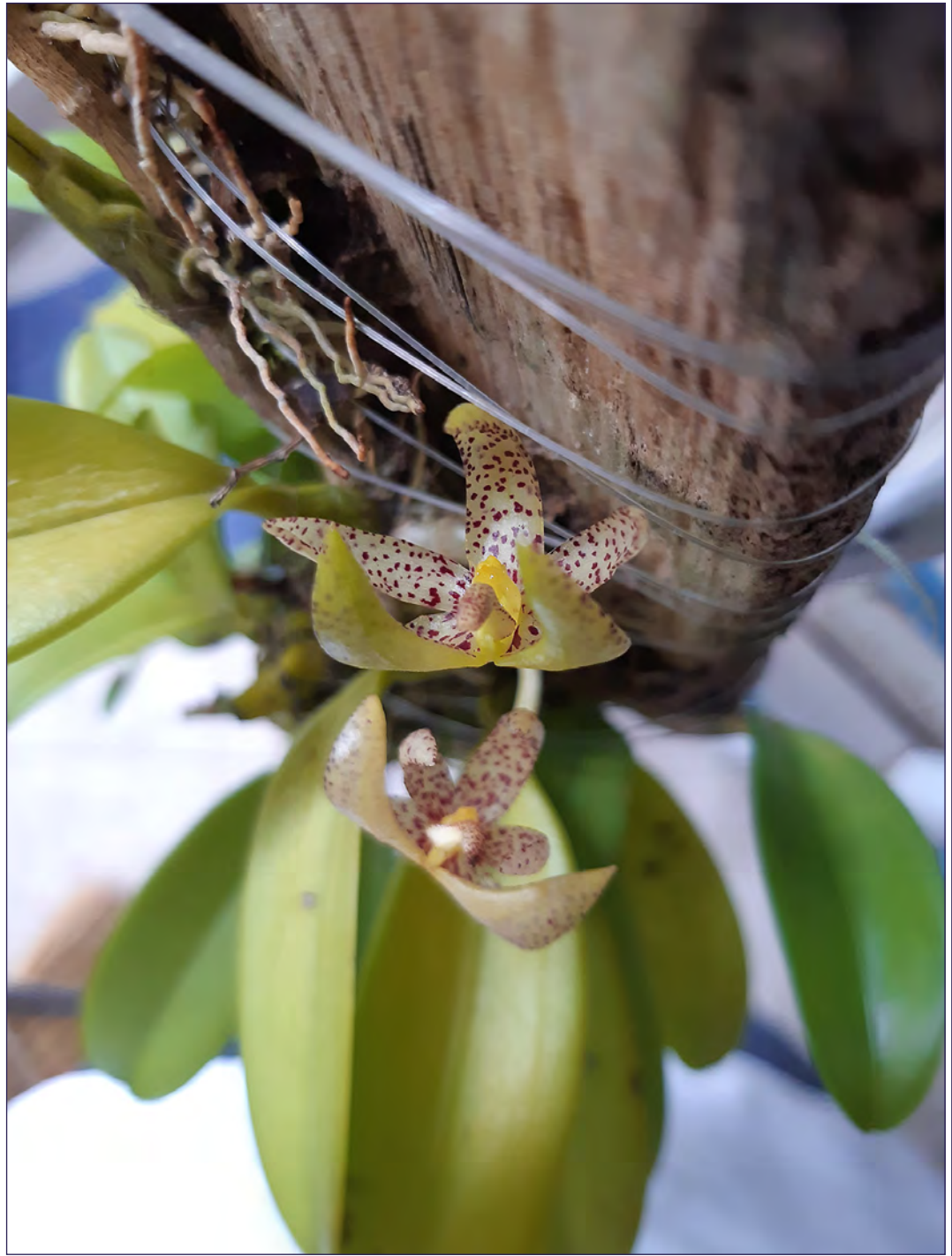
Bulbophyllum baileyi Trish Peterson