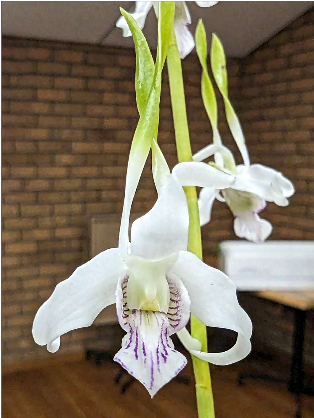
Dendrobium antennatum