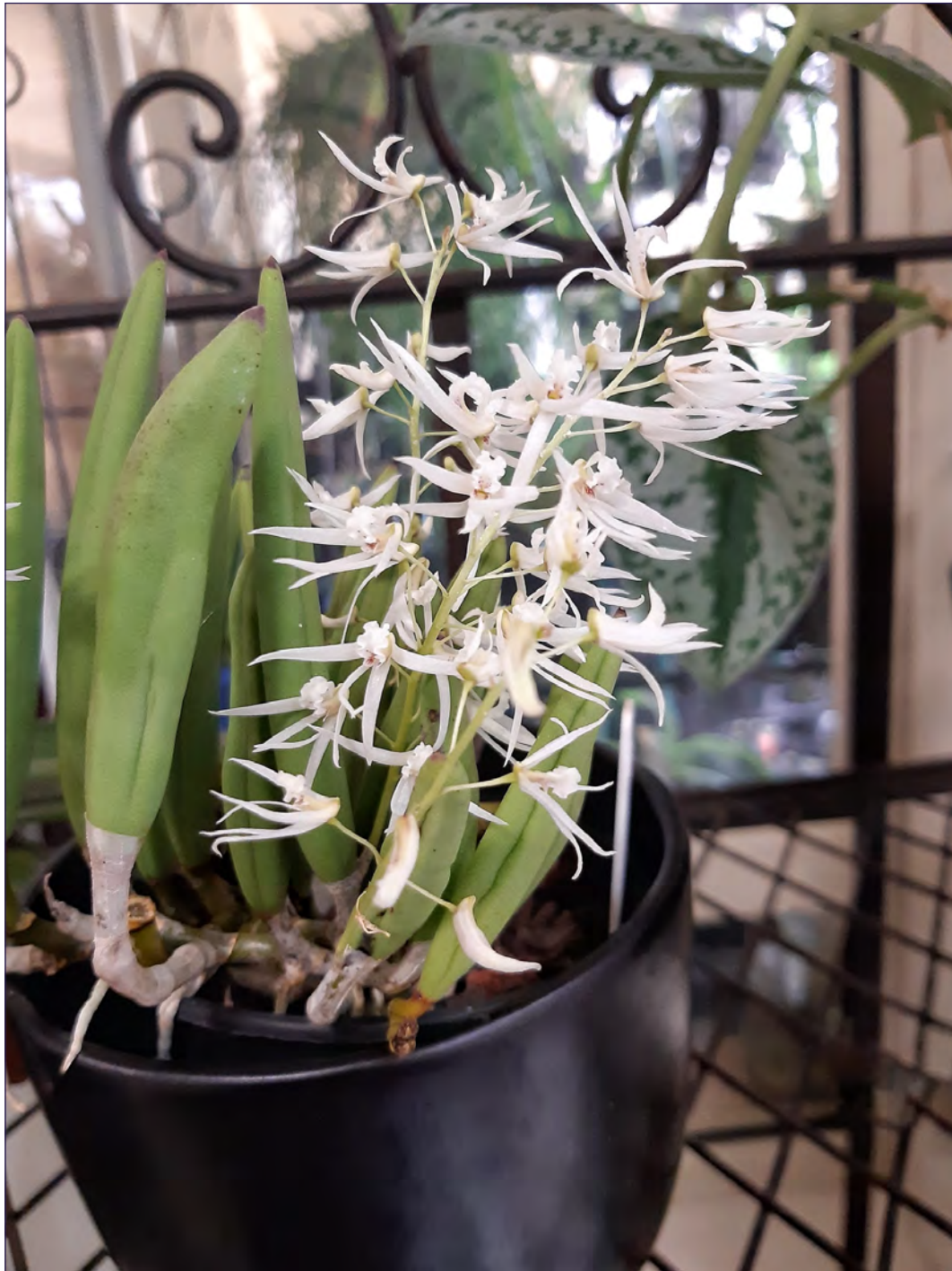
Dockrillia wassellii