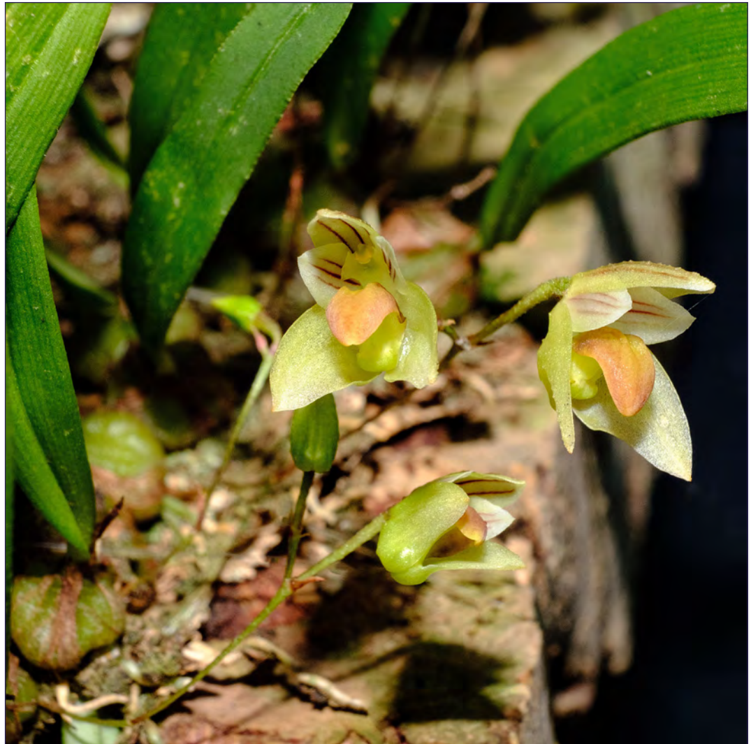
Bulbophyllum lageniforme Bill Dobson