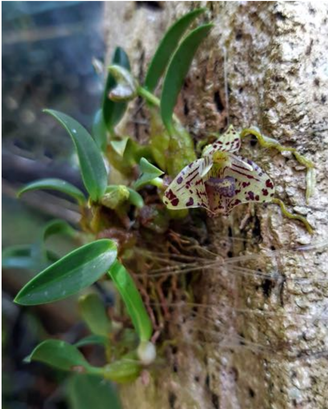
Bulbophyllum weinthalii Trish Peterson