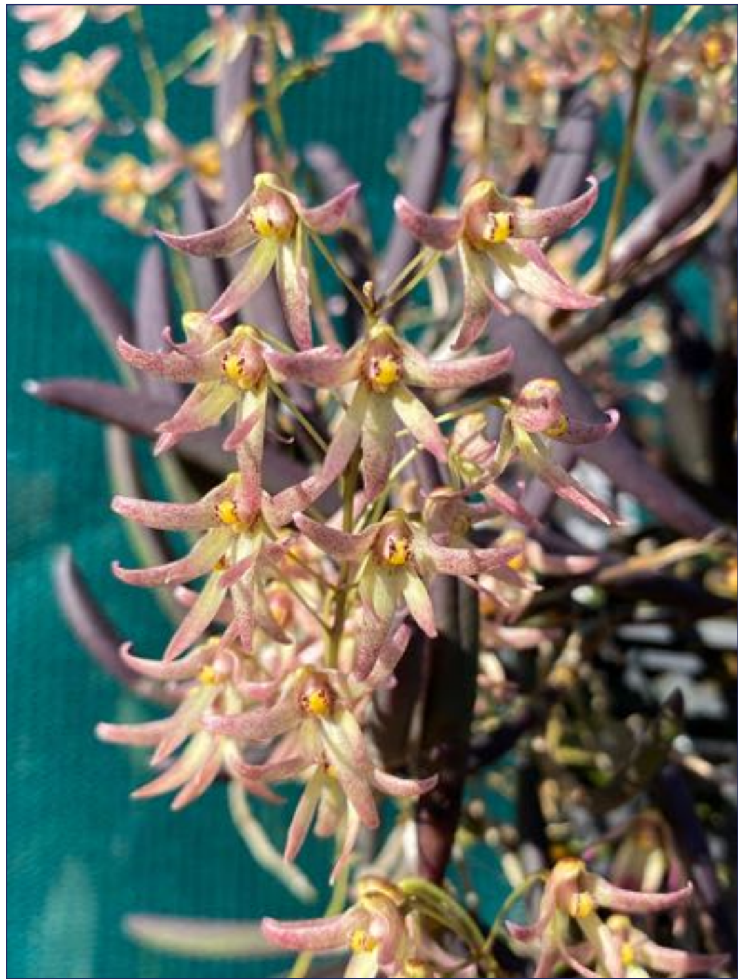
Doc. Lilac Queen x nugentii David Hemmings