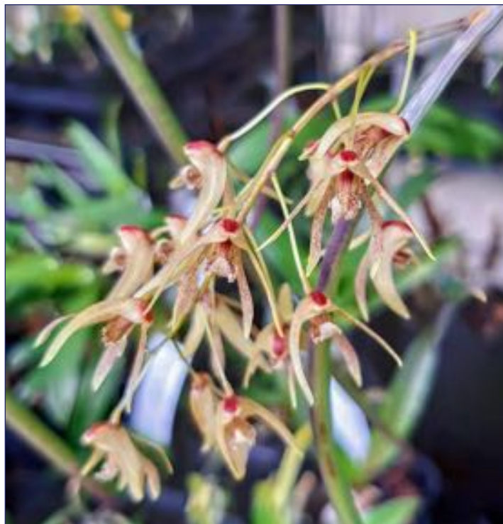
Dockrillia sulphurea x hepatica Trish Peterson