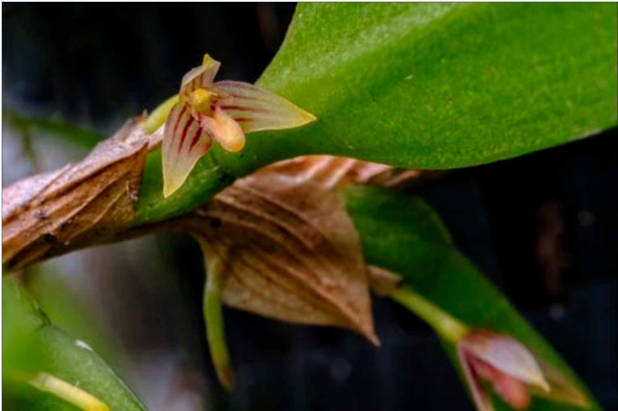
Bulbophyllum radicans L & B Dobson