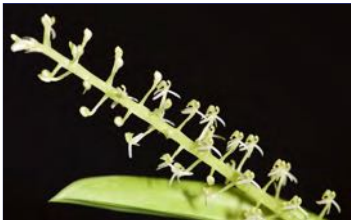
Liparis viridiflora