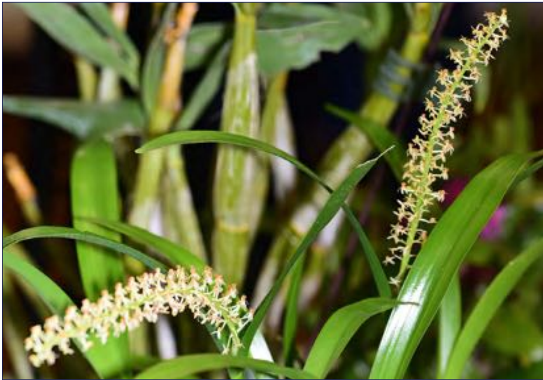
Liparis condylobulbon