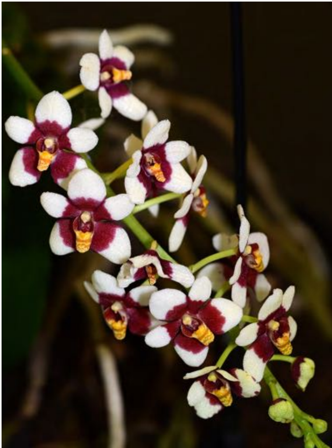
Sarcochilus Bessie Clover Bradley