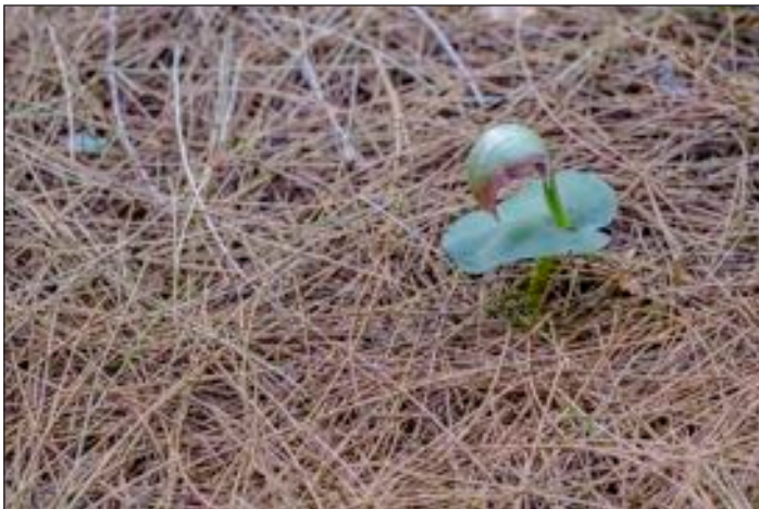
Corybas aconitiflorus