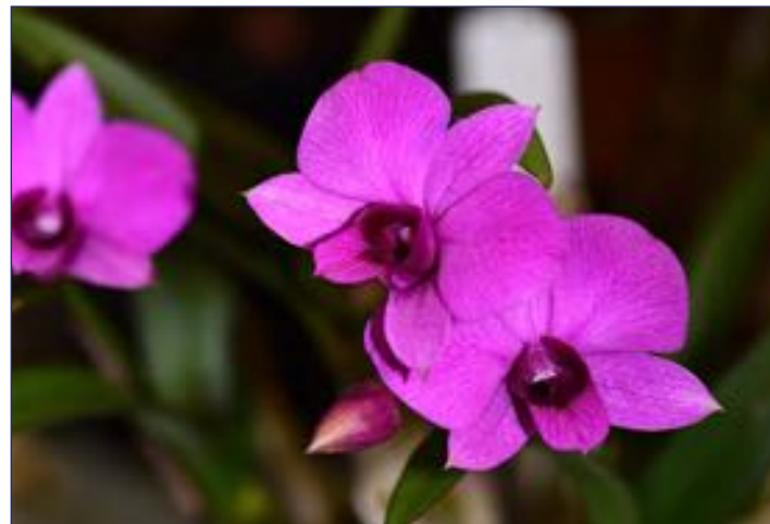
Dendrobium bigibbum hybrid Ela Kielich