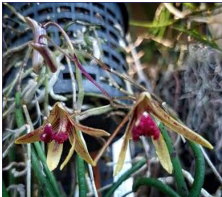
Dockrillia Tweetas 'Red Lip' Trish Peterson