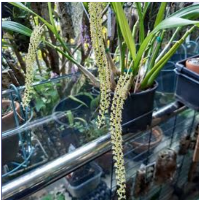
Liparis viridiflora