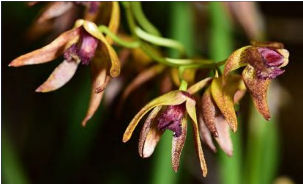
Doc. Tweetie Pie x Martin Gold David Hemmings