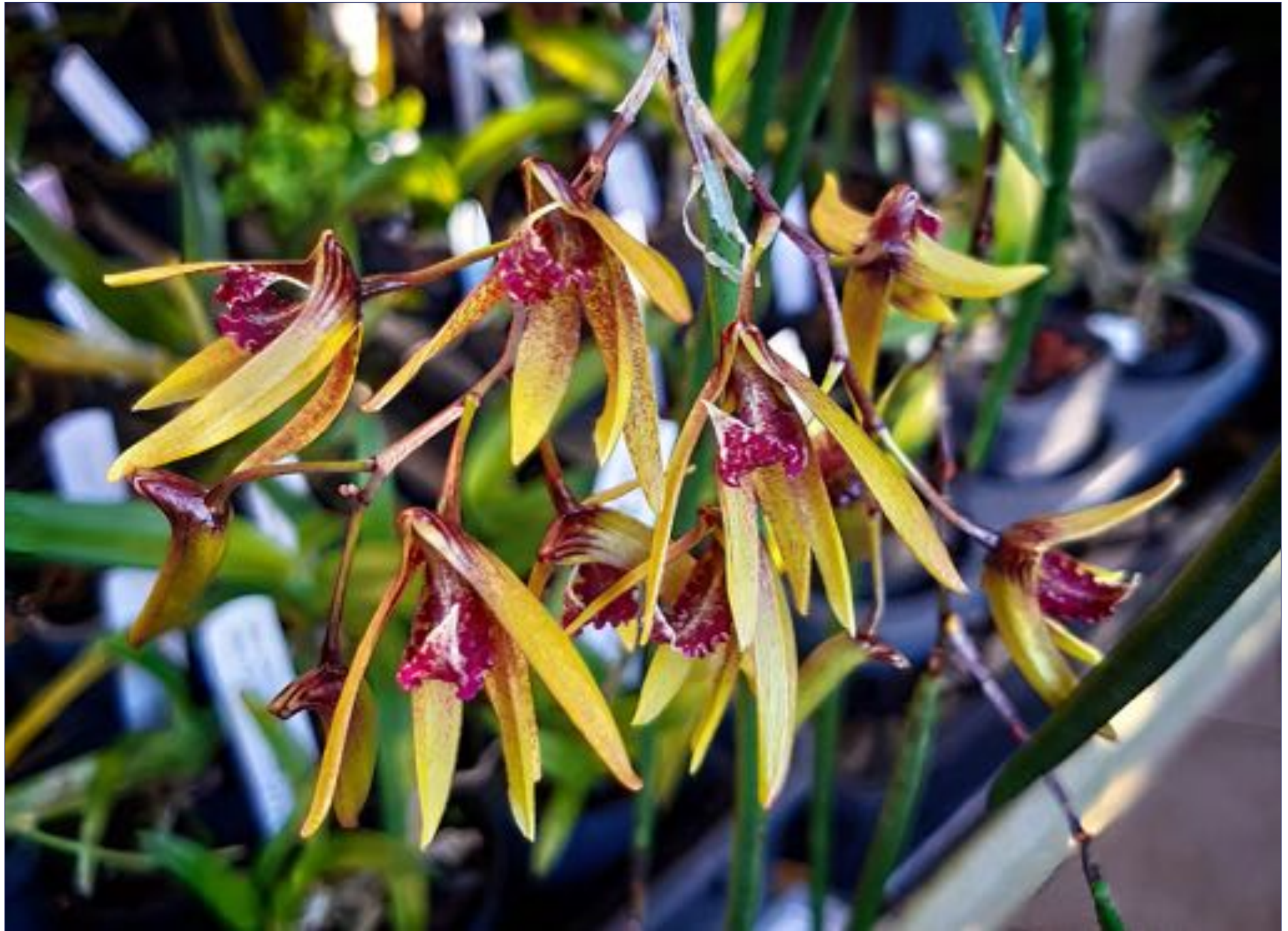
Dockrillia Tweetas x Granma Trish Peterson