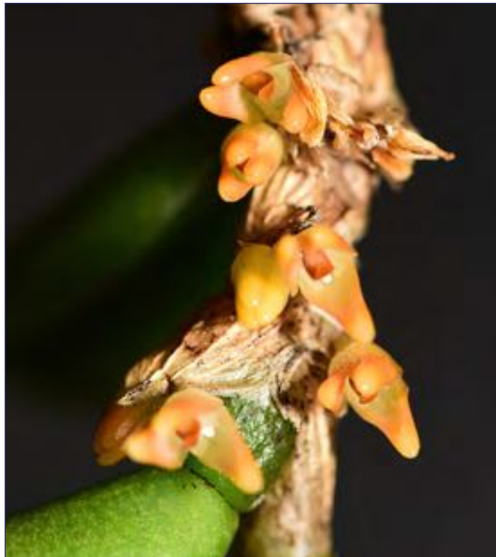
Bulbophyllum schillerianum