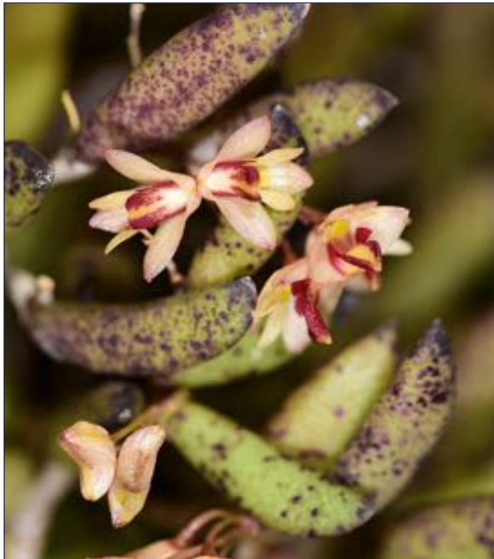
Dockrillia rigida