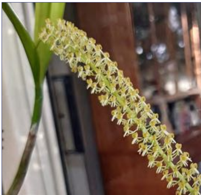
Liparis viridiflora