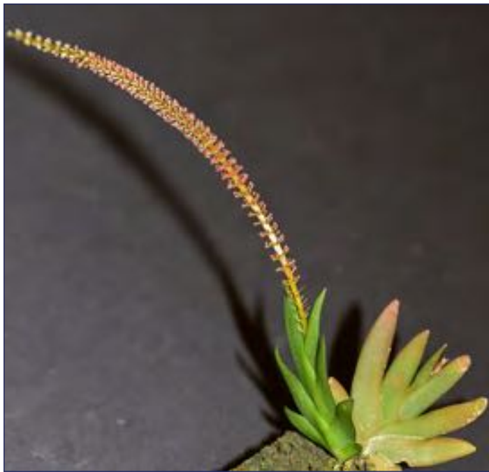
Oberonia palmicola