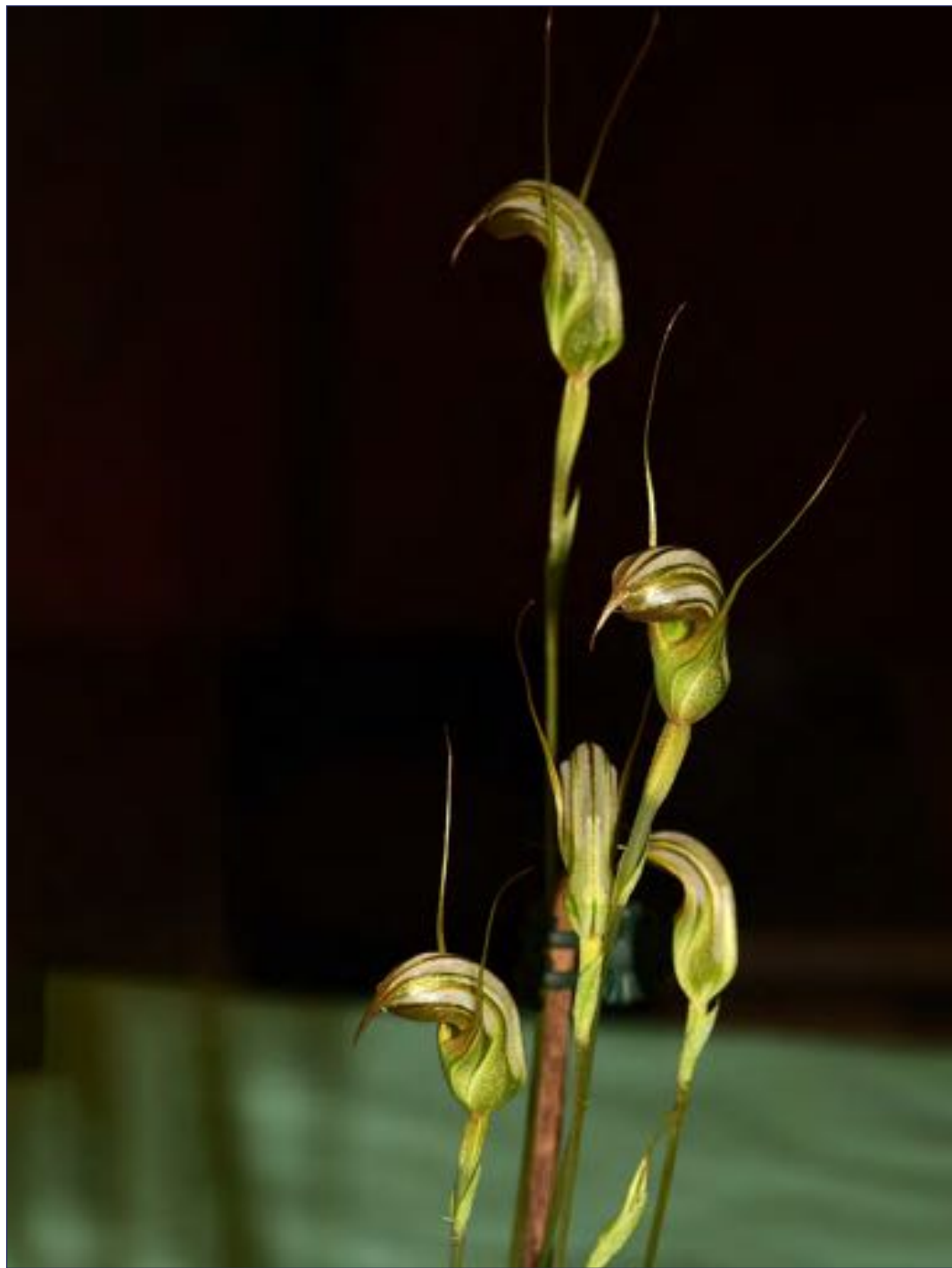
Pterostylis ophioglossa