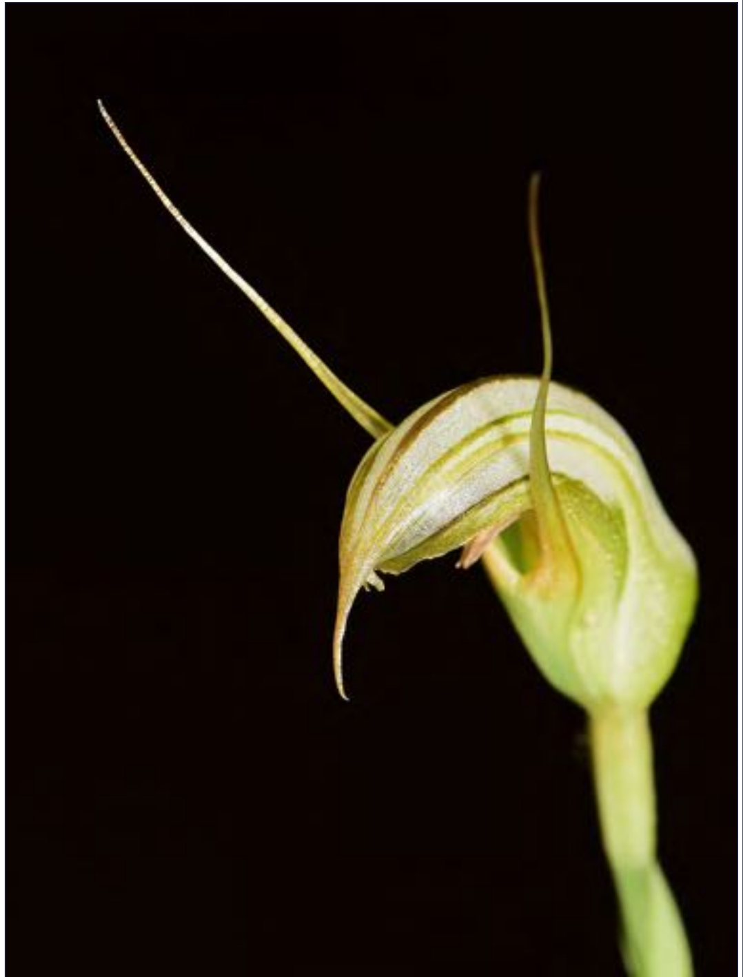
Pterostylis sp. I & I Chalmers