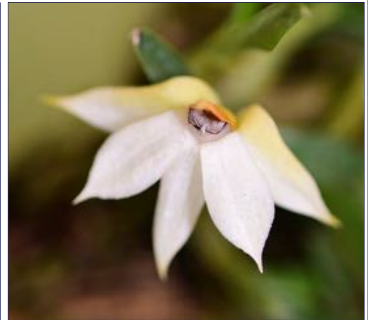
Dendrobium cynocentrum