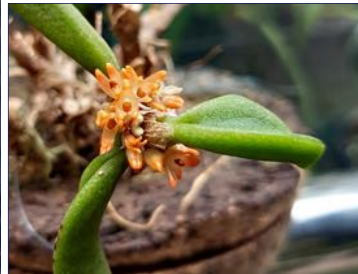
Bulbophyllum schillerianum Trish Peterson