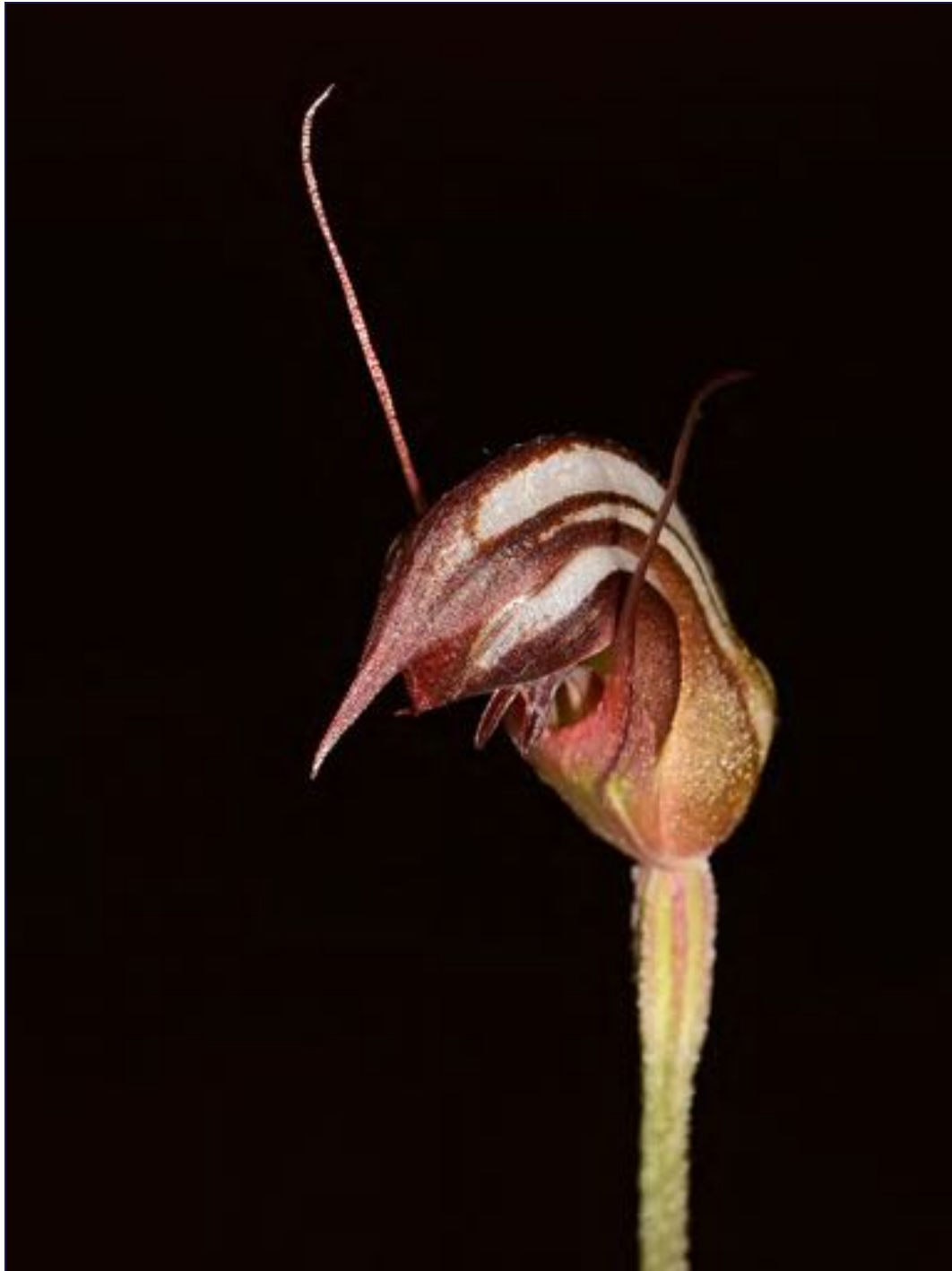
Pterostylis collina