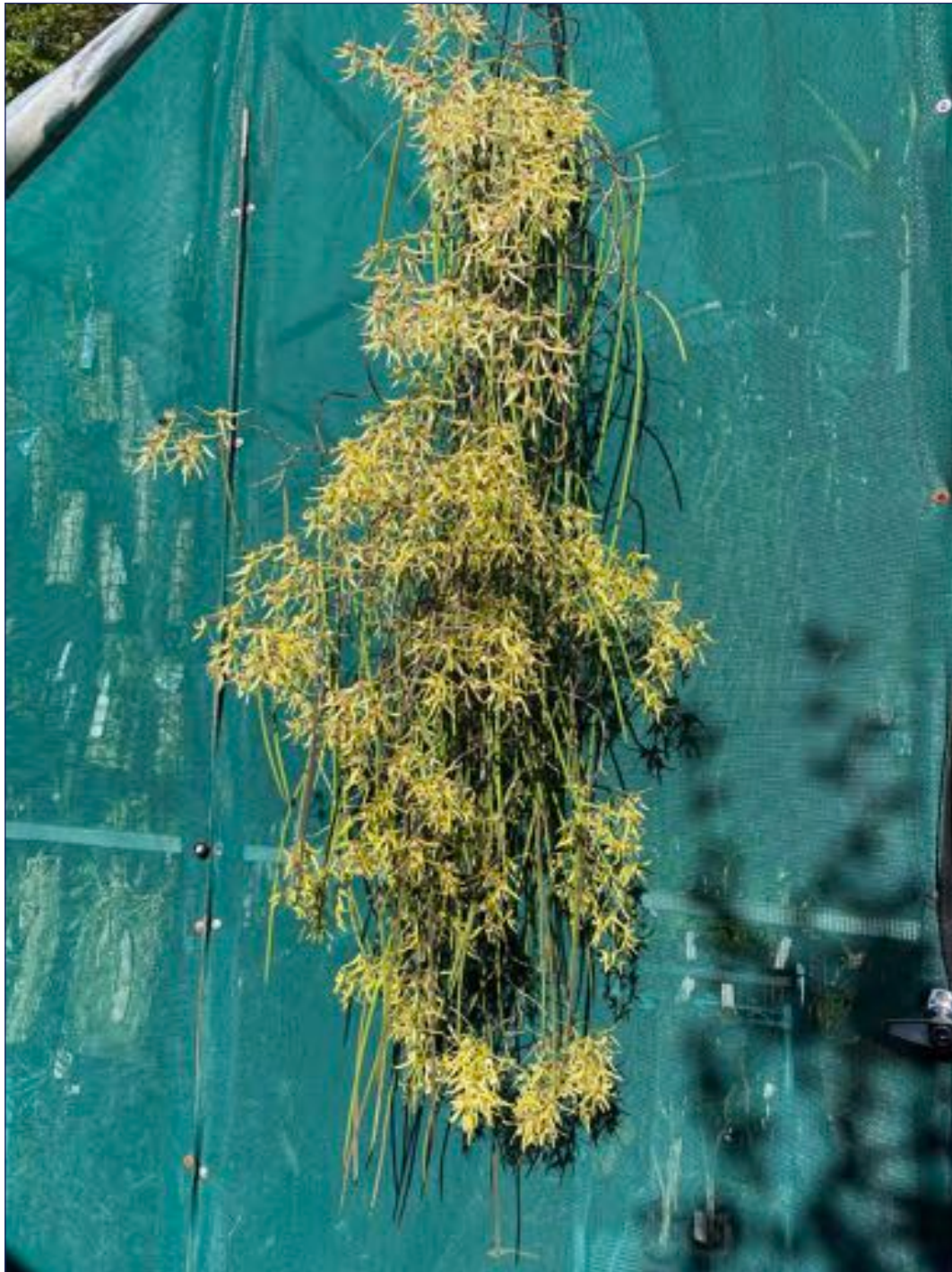
Doc. Sabateur David Hemmings