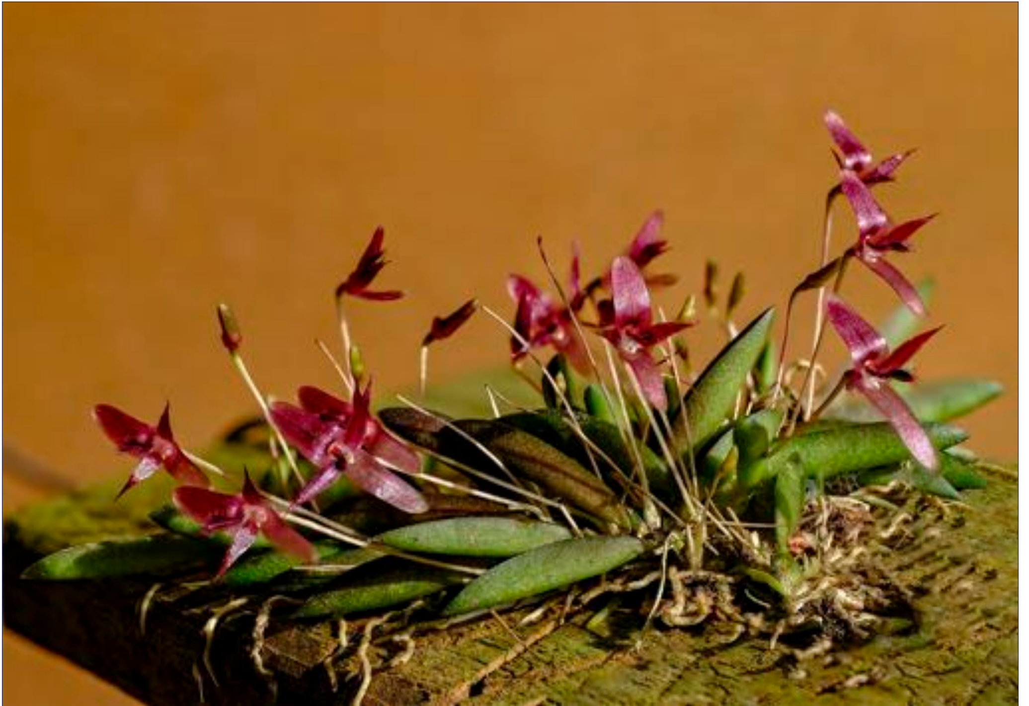
Bulbophyllum macphersonii L & B Dobson