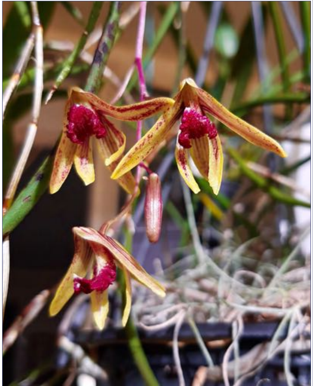
Dockrillia Tweetas 'Red Lip' Trish Peterson