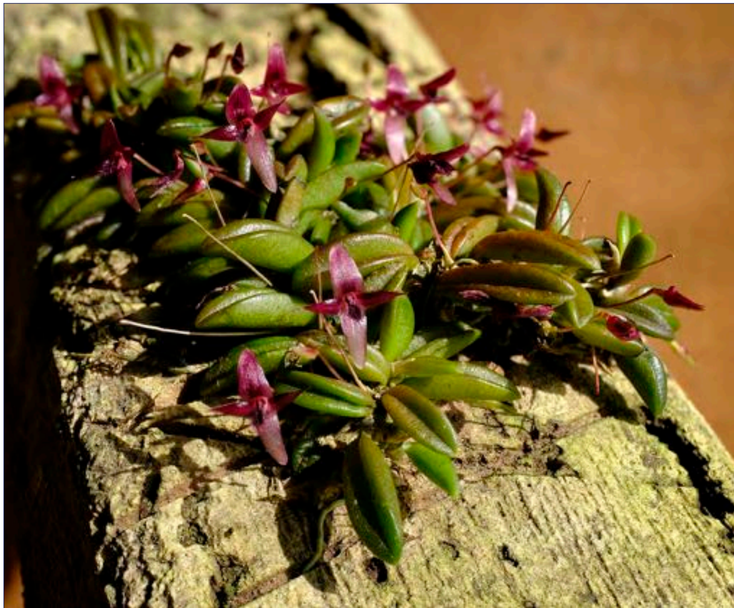
Bulbophyllum macphersonii L & B Dobson