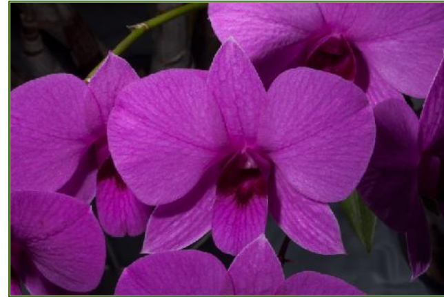
Dendrobium bigibbum – Ela Kielich