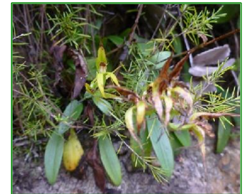
Rimacola elliptica – Blue Mountains