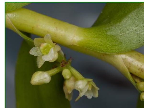
Podochilus australiensis