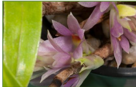
Den. bracteosum