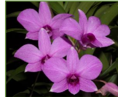
Den. bigibbum hybrid