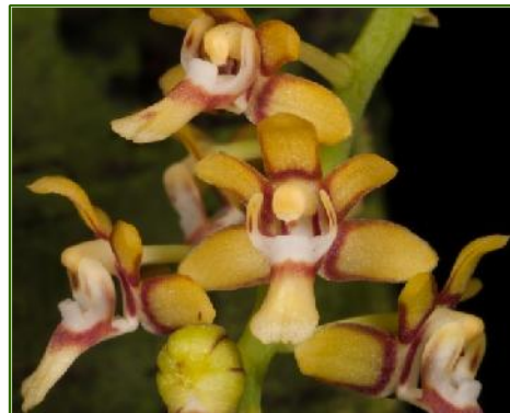
Sarcochilus hirticalcar