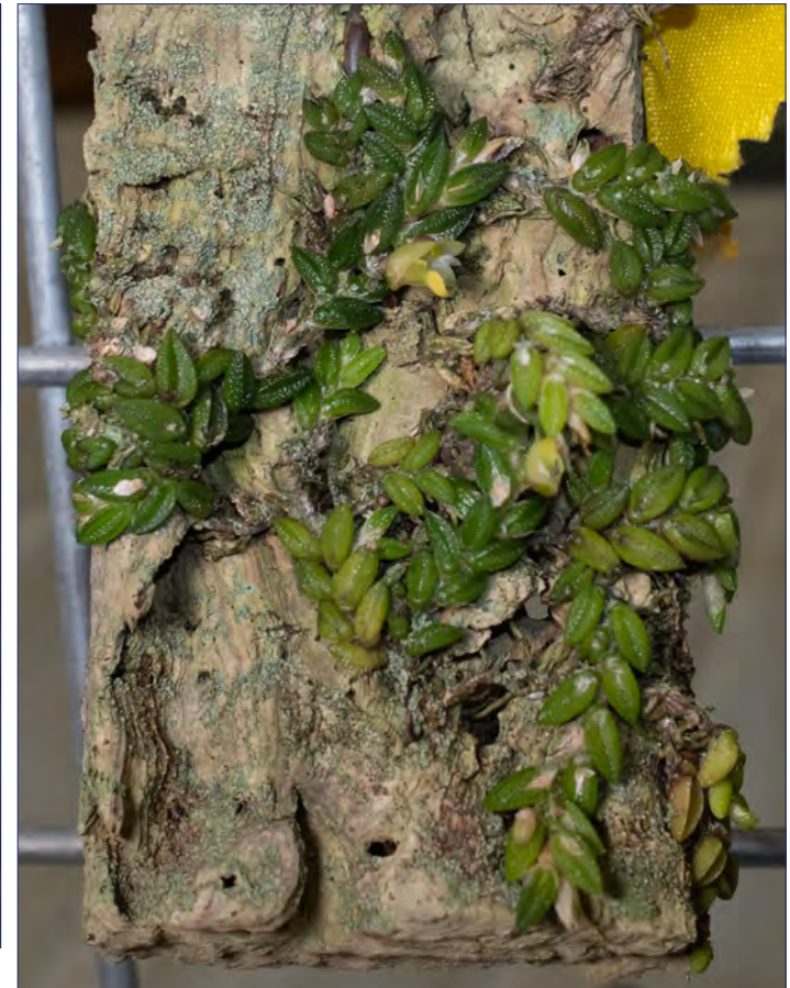
Dendrobium toressae