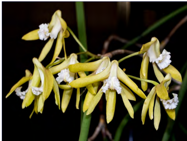
Dockrillia Amphion Helios