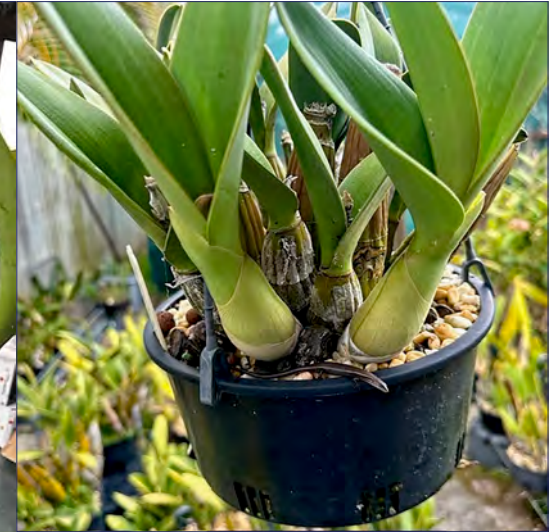
Den. speciosum var pedunculatum