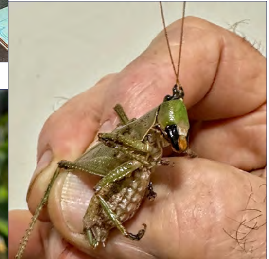
'Hello Grasshopper' Bill Dobson