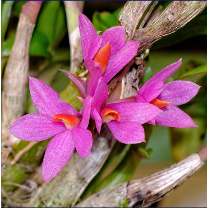
Dendrobium Hibiki Li Shan