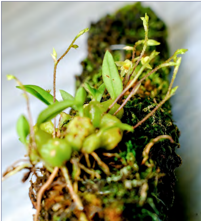
Bulbophyllum argyropas