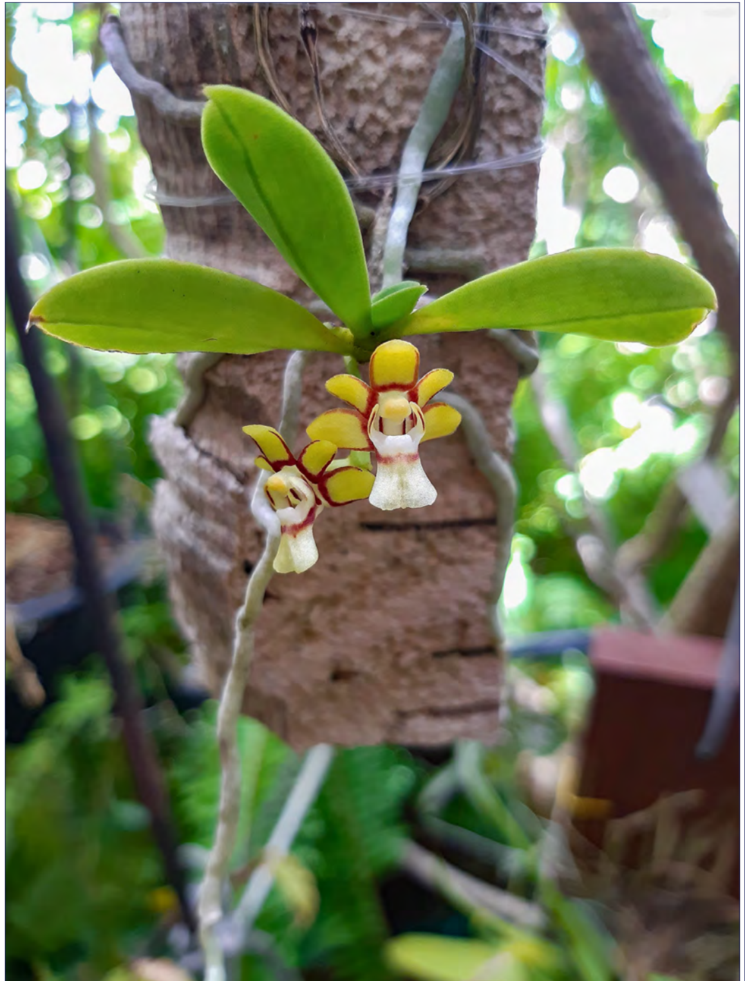
Sarcochilus hirticalcar Trish Peterson