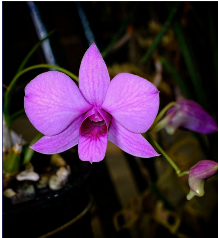
Dendrobium bigibbum var. compactum