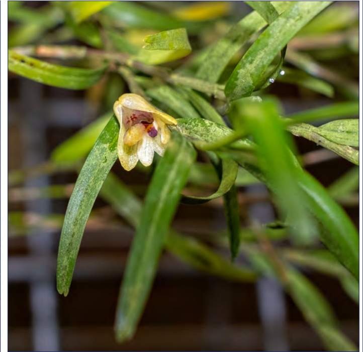
Dendrobium malbrownii