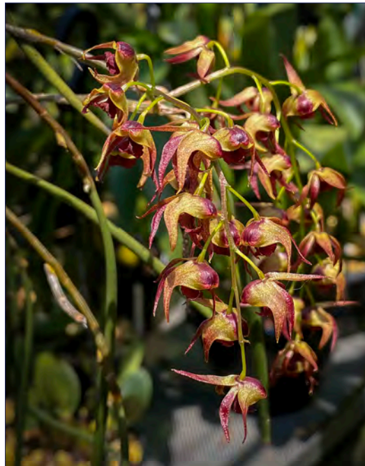
Dockrillia hepatica