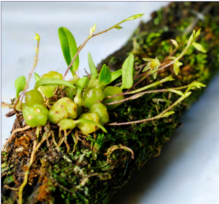
Bulbophyllum argyropas