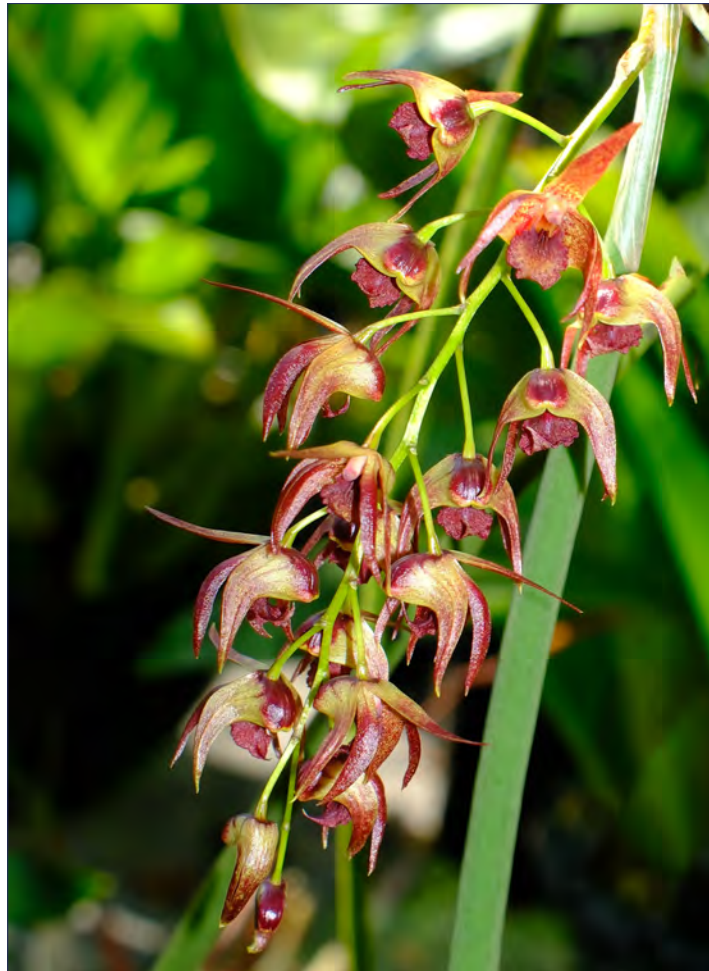
Dockrillia hepatica L & B Dobson