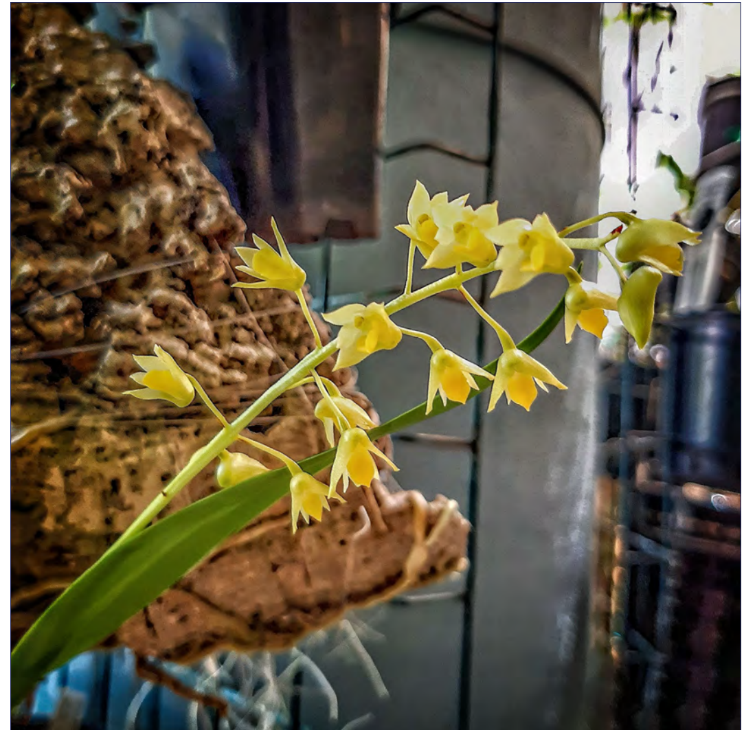
Dendrobium monophyllum Trish Peterson