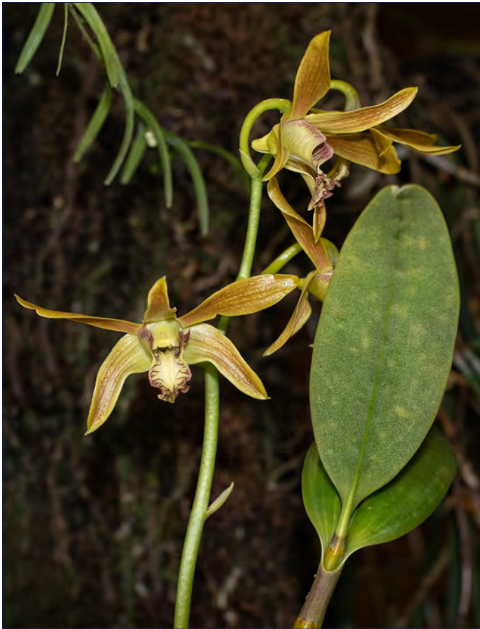
Dendrobium mirbelianum