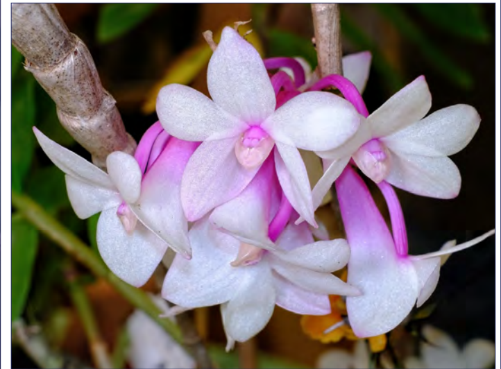
Dendrobium Pink Glow Li Shan