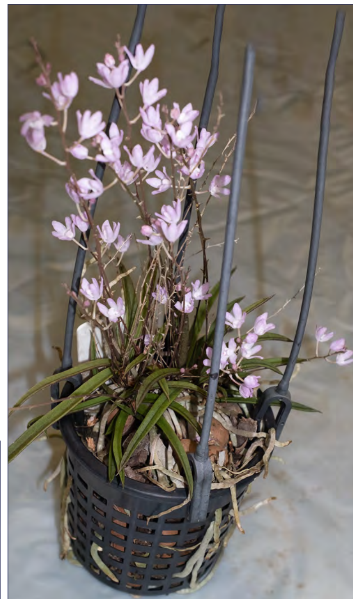
Sarcochilus eriochilus