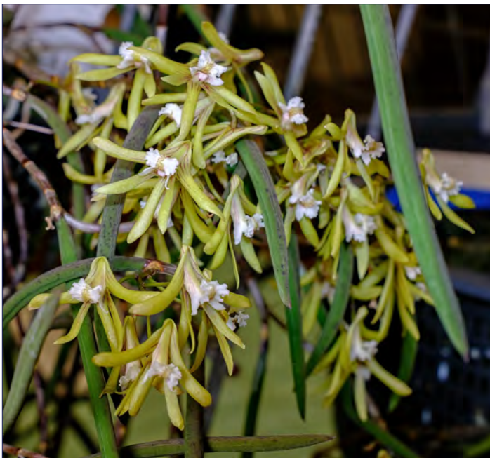
Dockrillia brevicauda