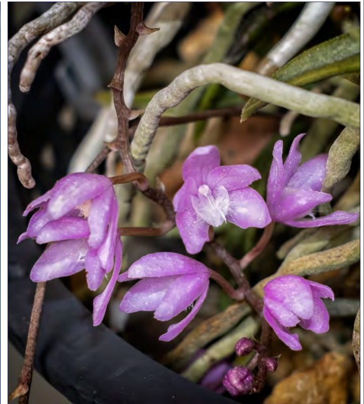
Sarcochilus setosus