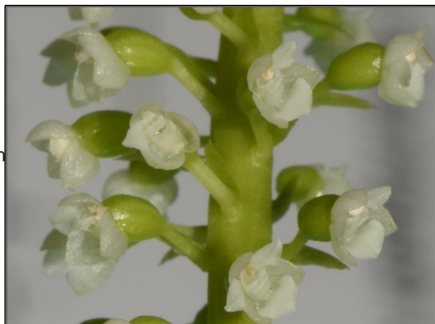
Phreatia micrantha