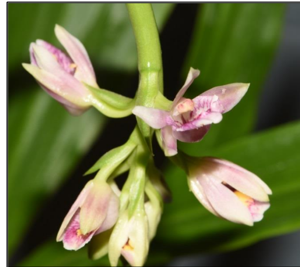
Geodorum densiflorum