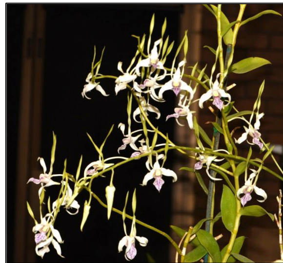
* Dendrobium Samarai