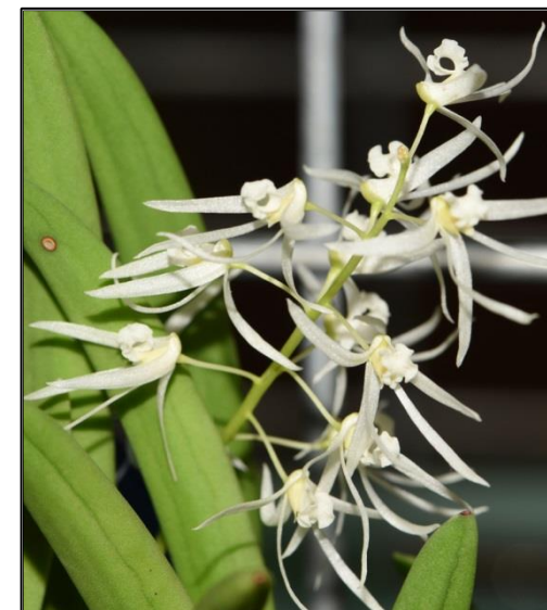
Dockrillia wassellii