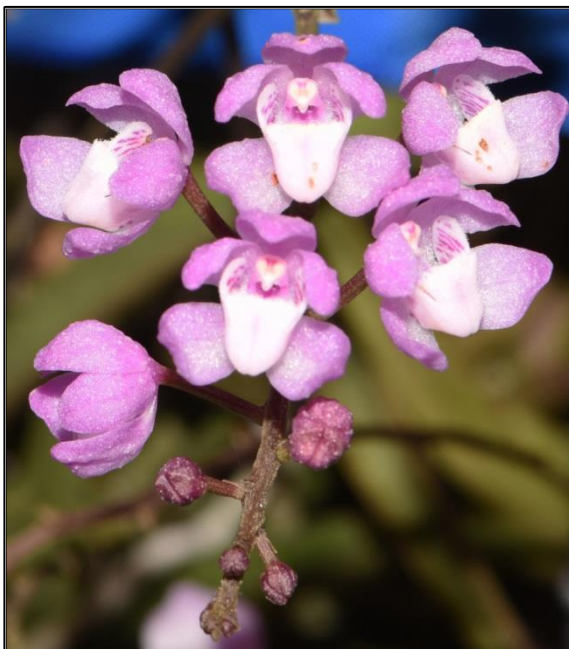
Sarcochilus ceciliae – L & B Dobson