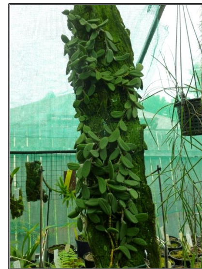
Doc. linguiforme var nugentii