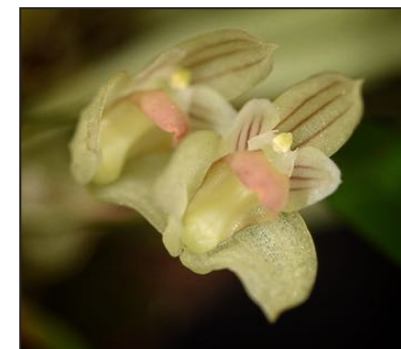
Bulbophyllum lageniforme