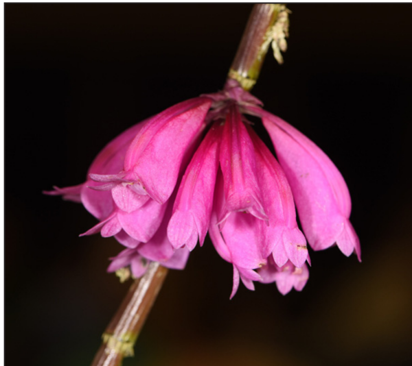
Dendrobium lawesii