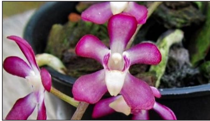
A differently coloured Prschs. Cherub

In the case of Prschs. Cherub, the tiny-flowered species Peristeranthus hillii was crossed on to the purple hybrid Sarcochilus Elise ( S. ceciliae x S. Nicky ). This pollination came about because I had been given a raceme of Perths. hillii flowers and S. Elise happened to be in flower at the same time. From this chance crossing of S. Elise 'Plum' x Perths. hillii we now have Peristerchilus Cherub, a beautiful little novelty.