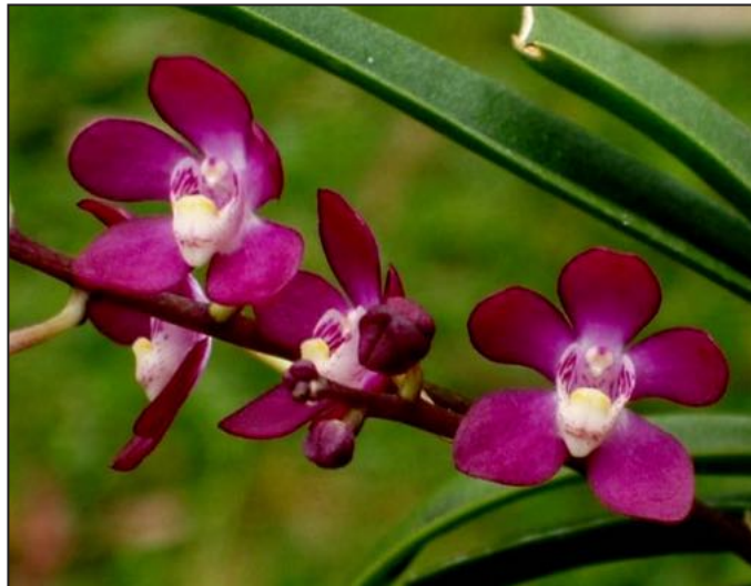
Sarcochilus Elise 'Plum'

Despite its parent Perths. hillii being quite epiphytic, most growers find Prschs. Cherub amenable to pot culture. This and many similar hybrids can be grown happily in pots provided drainage and air circulation are adequate. The grower often chooses a relatively coarse bark for the potting medium, and has the pot hanging freely, or suspended from the wall of the shade-house for unimpeded air circulation.